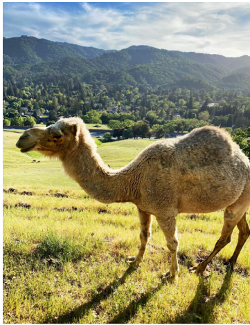
A grazing camel

grazing cattle are mostly mixed breeds, which is why they don't all look the same. They help maintain the land by keeping the grass trimmed."