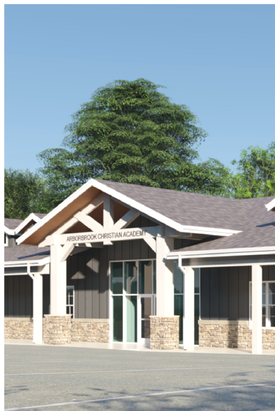
Renderings like this one that depict the new Upper School building excite the Arborbrook community.

For nearly two decades Arborbrook has done a lot of growing from well developed roots.