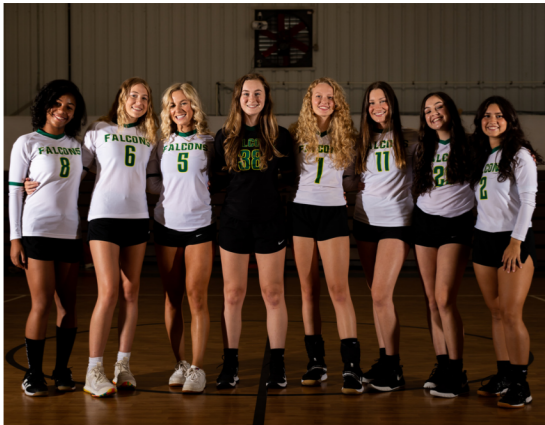
Arborbrook Falcons 2022 Varsity Volleyball Seniors

The Arborbrook Athletics program has experienced tremendous growth this Fall. Volleyball, cross country, soccer, and tennis have all had successes and continue to improve.