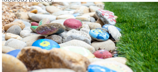
Student painted rocks adorn the Peace Garden in the Building 2 courtyard.