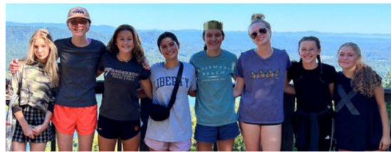
Together, High School students conquered a hike to the Camp Harrison overlook.