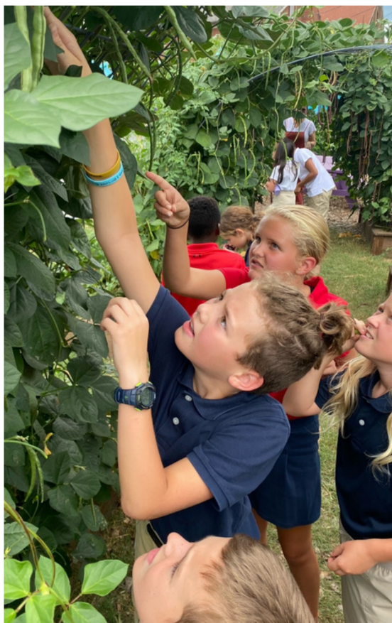
Outdoor learning continues to be a hallmark of Arborbrook. Here, a group of 6th grade students explore the garden's bean trellis tunnel.

Today, Arborbrook is at a transitional point.