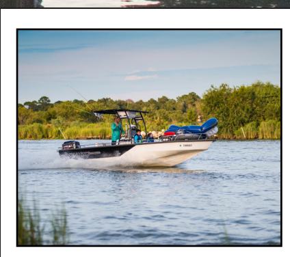
Fun on the Water Page 5