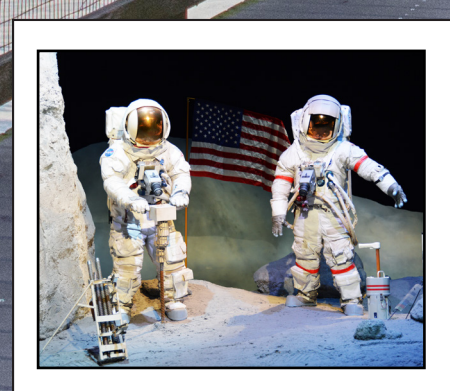
Space Center Houston Page 2

Read on to see how the many unique aspects of Nassau Bay come together to create the perfect destination for a vacation, road trip or new home!