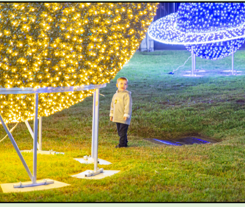
Plan to attend from November - January