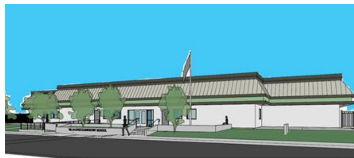
Proposed Entry View (rendering)