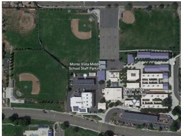
MVMS (shown with solar array)

On Aug. 3rd several community members joined to celebrate a commemorative projects ribbon cutting, which recognized the achievements and goal of TUSD's sustainably mission in creating a districtwide cumulative 5.3 Megawatt energy producing solar portfolio system. Further to this, the solar project is expanding onto its next marked sites; North School and the Clover/TLC which will have a planned completion of Feb. 2023