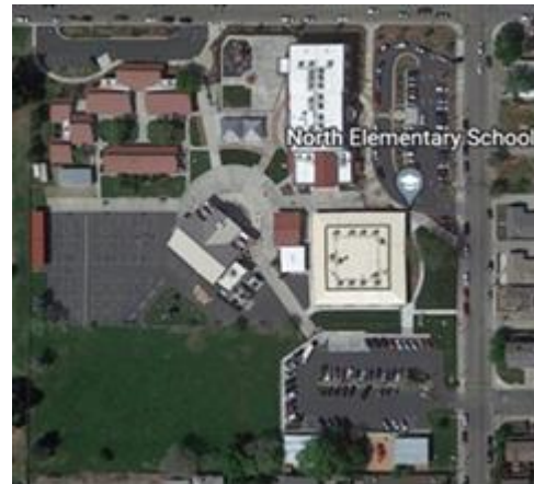
North School (pending solar array)