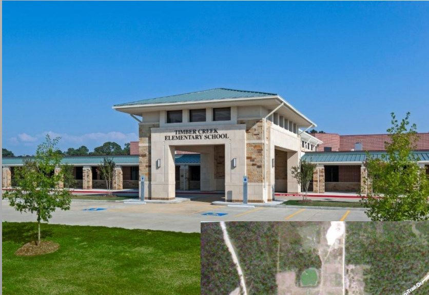
Timber Creek Elementary