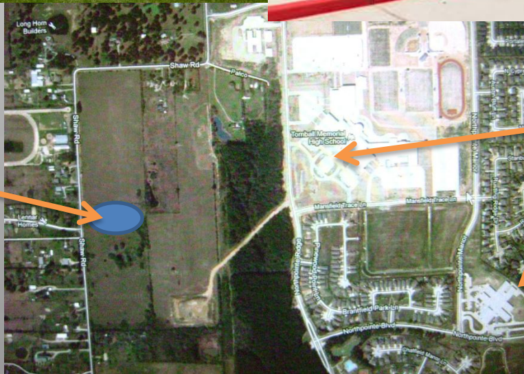
Tomball Memorial High School