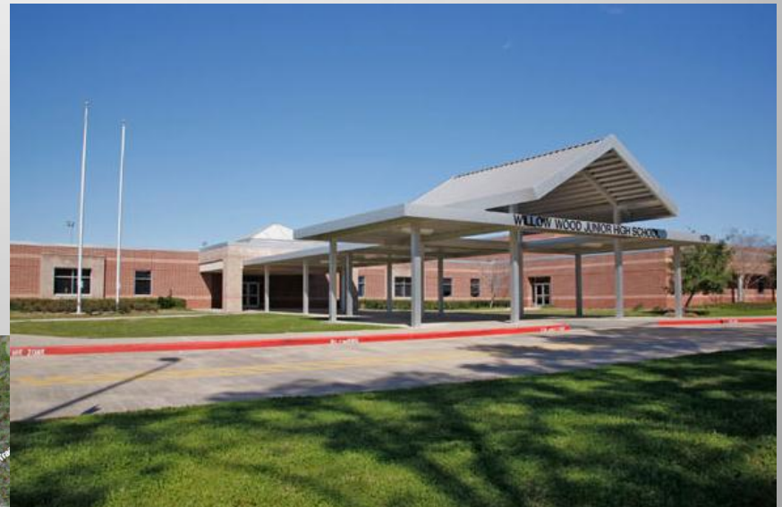
Willow Wood Junior High