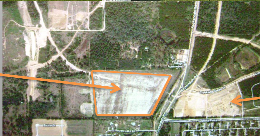
Timber Creek Elementary