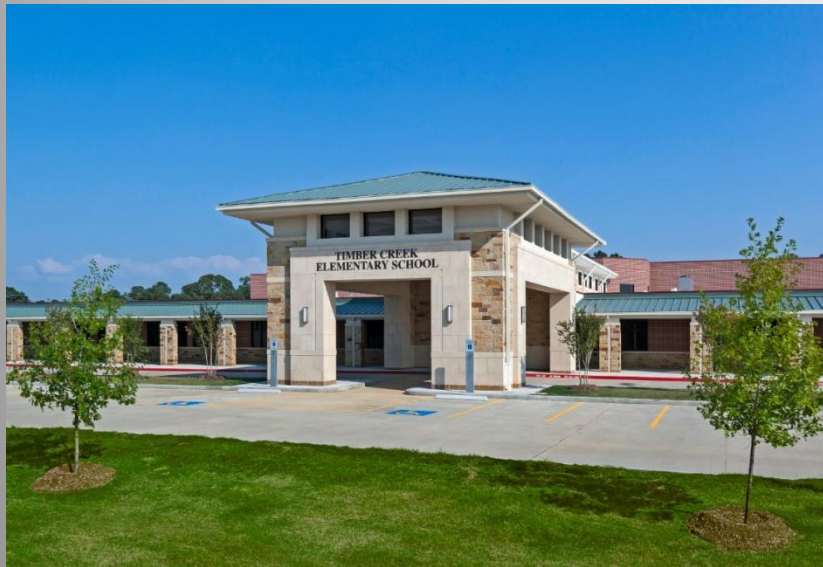
Timber Creek Elementary