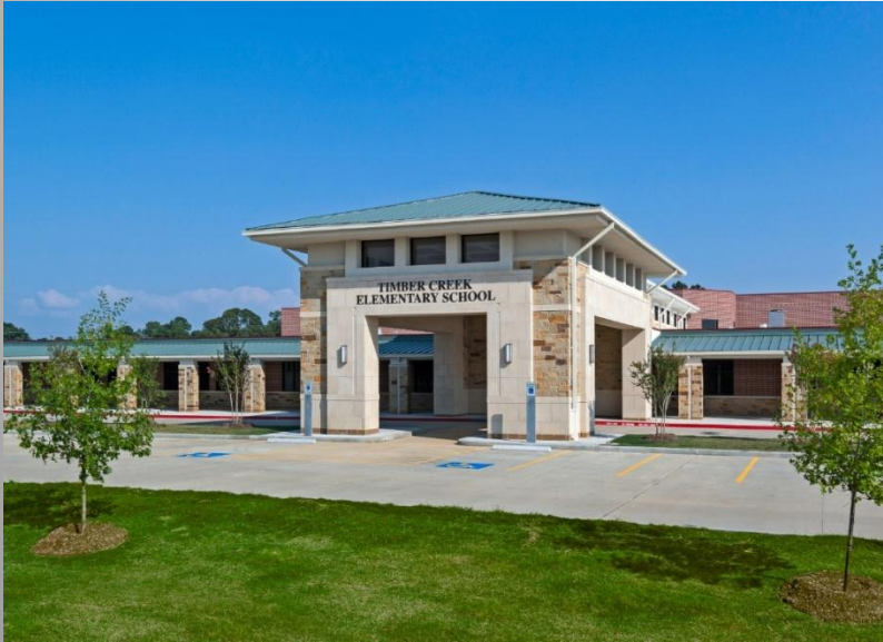
Timber Creek Elementary