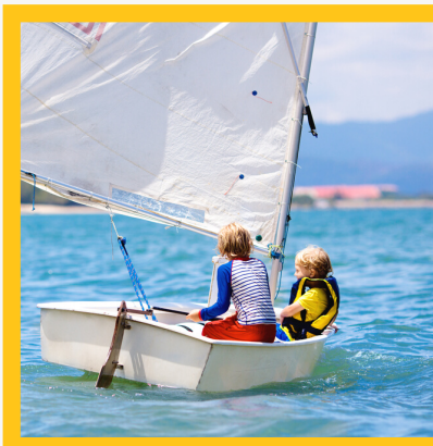
Learn to Sail