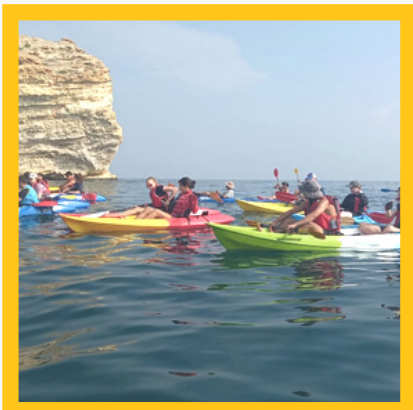
Sea Kayaking Expedition