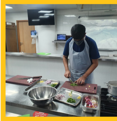
Junior Chef's Cookery Course