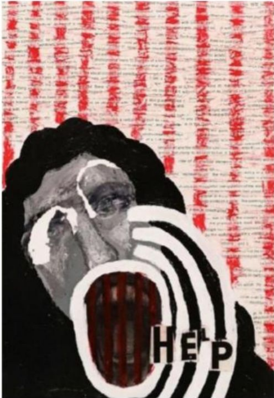
KYA DYOUS-GOULDEN "SILENCED", MIXED MEDIA, HONORABLE MENTION (2021)