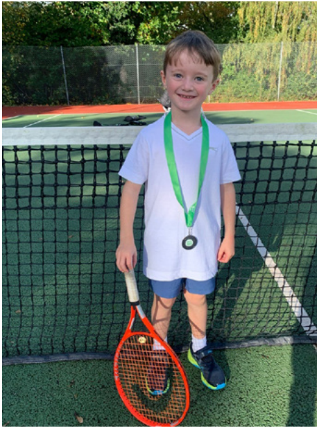
Finn S also competed in an U8 tournament in Wellington and came second. Fredi D-H (No photo) played in an U11 grade 5 tournament in Bridgwater over half term.