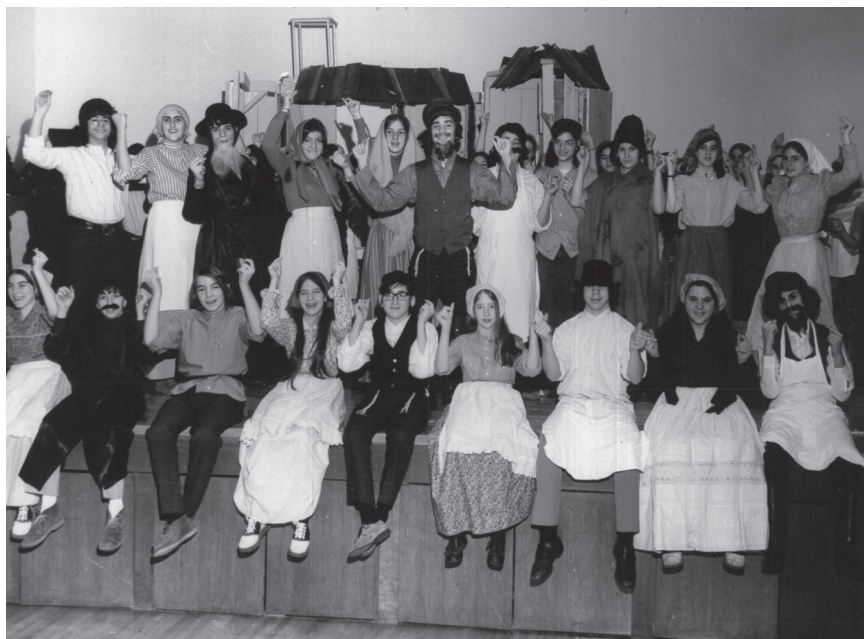
Students perform in the school's 1973 Operetta, Fiddler on the Roof .

Bernard Zell Security and the AES Maintenance Staff