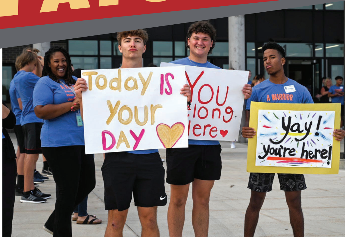
Two Rivers High School seniors welcome students on the first day of school.

Our nearly 900 employees are dedicated to the success of our students.