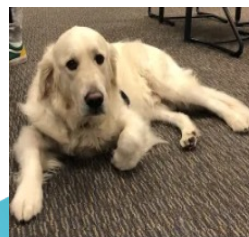
Toby Felton - Wednesdays