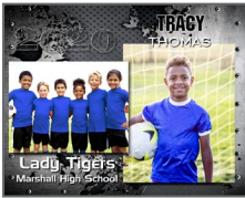
Memory Mate = Team & Individual!