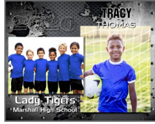
Memory Mate = Team & Individual!