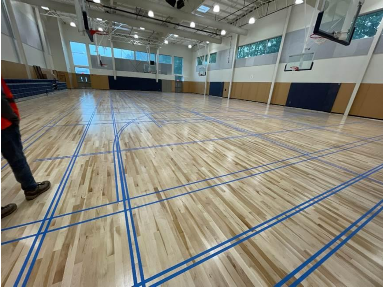
Game lines in the Auxiliary Gym are taped out and ready for paint