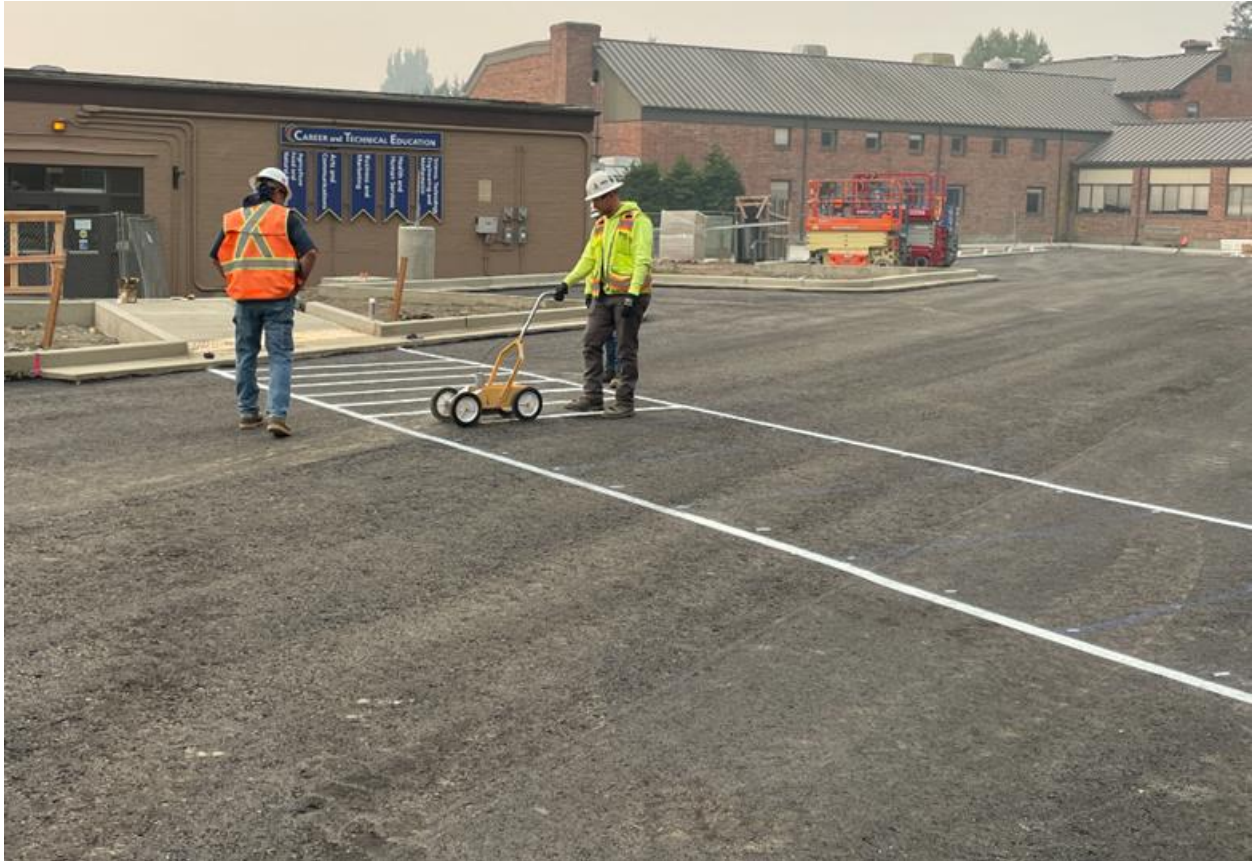
Temporary crosshatching for the ADA crossing in the parking area south of the Academic Wing