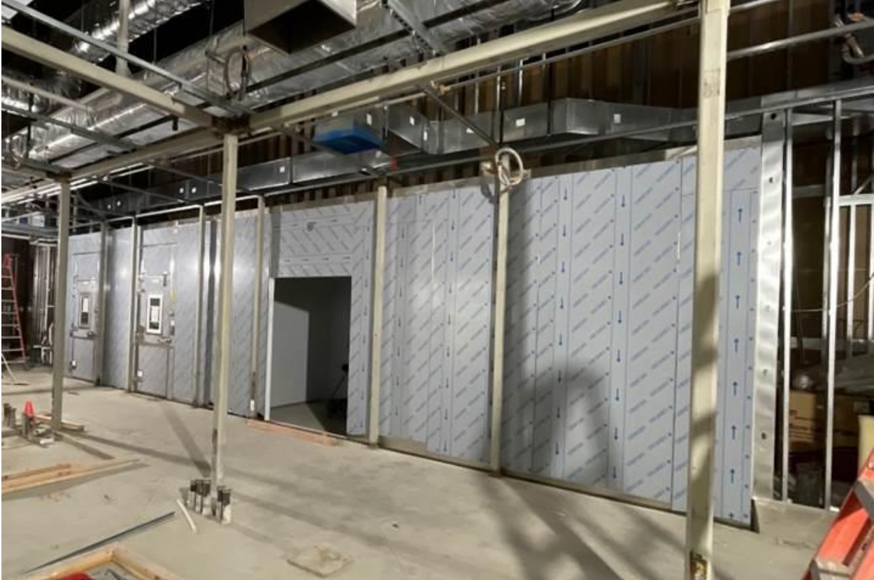
The walk-in cooler in the Kitchen Area is now in place