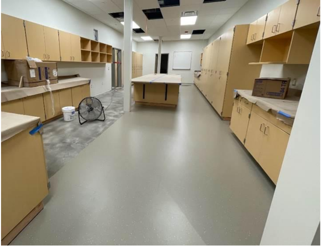
Flooring installation in the staff work room