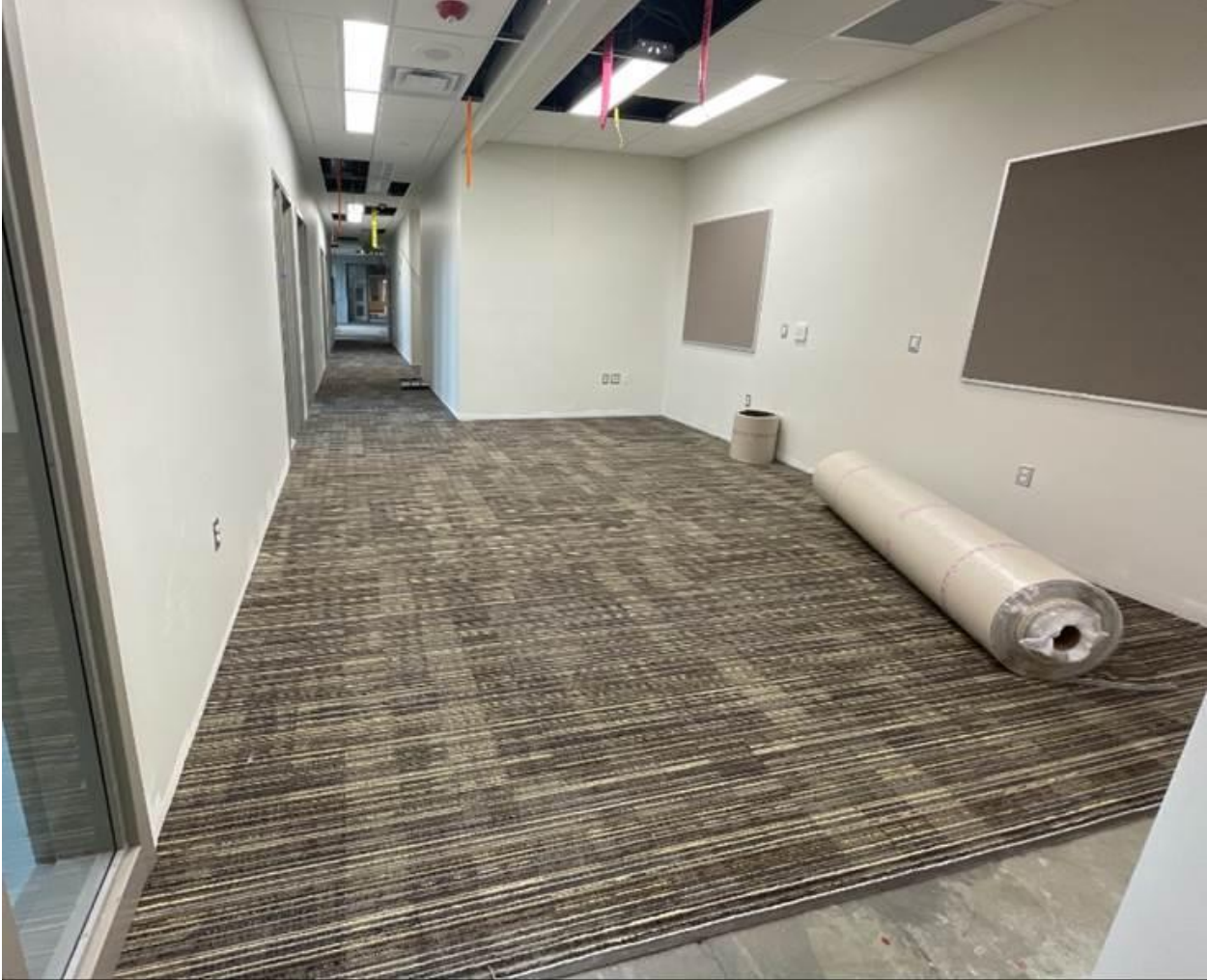
Carpet installation in the new administrative space