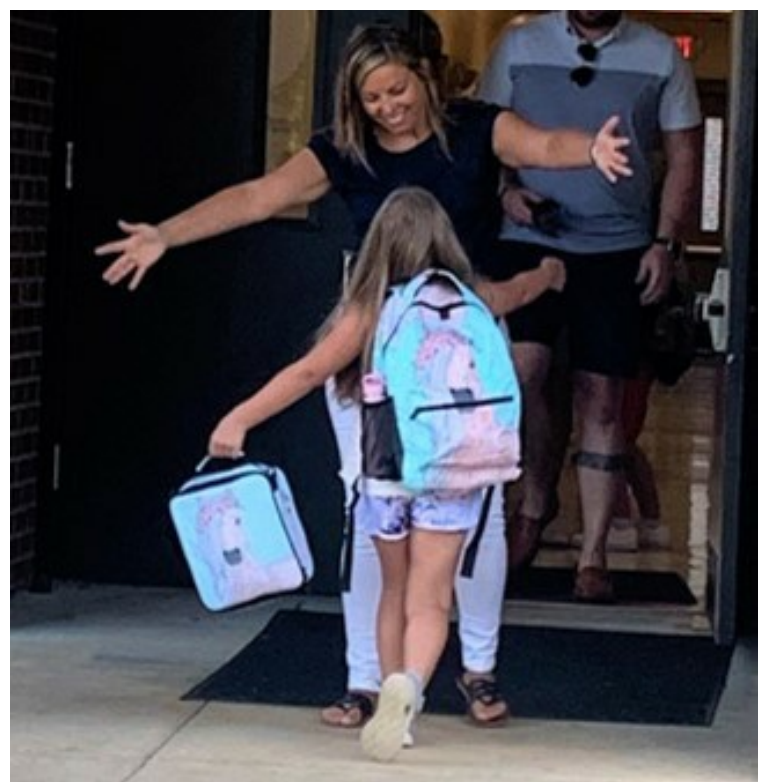
Welcome to a new school year, with arms wide open!