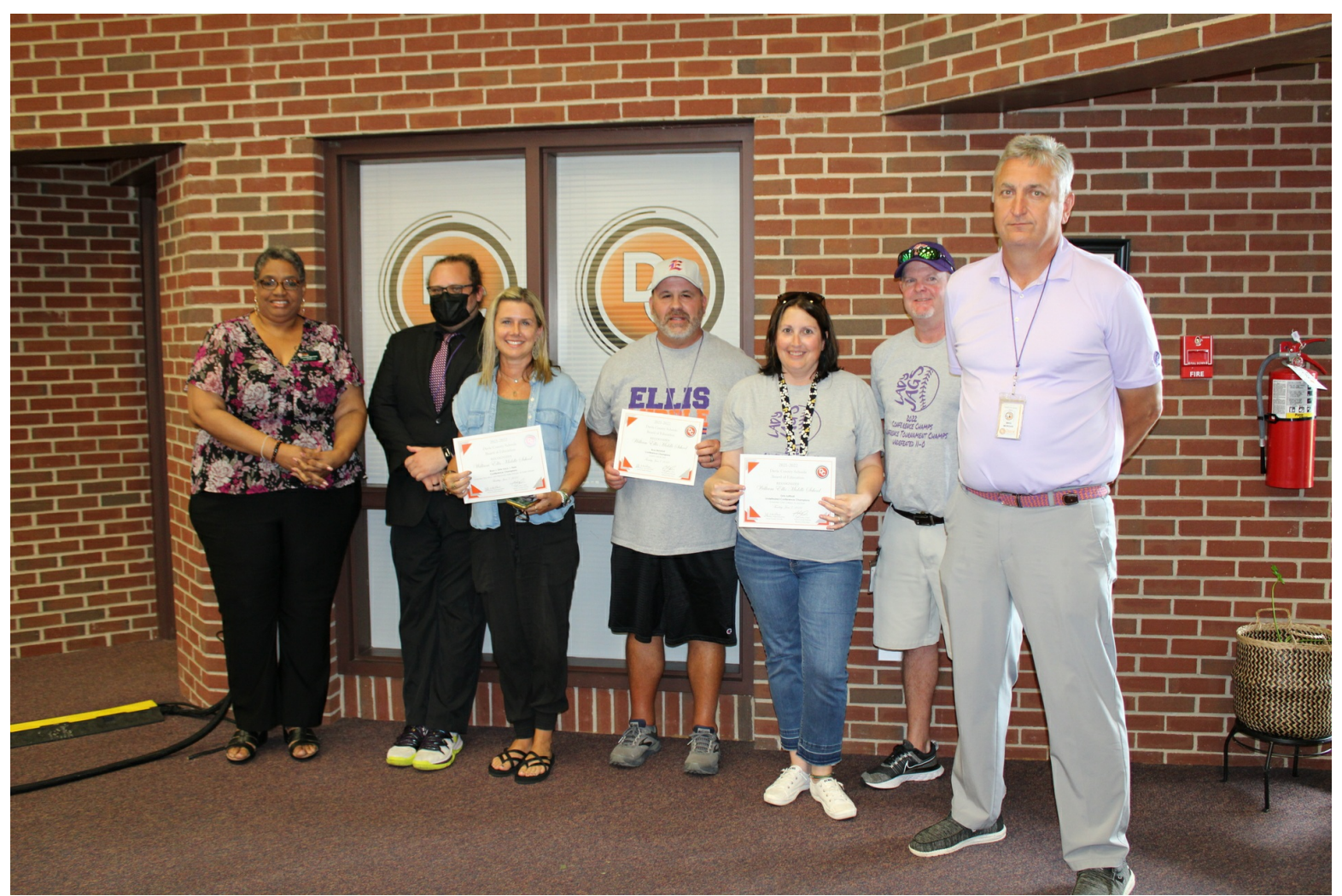
William Ellis Middle School Track & Field, Baseball, and Softball