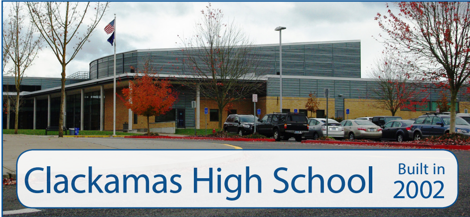
Clackamas High School Built in 2002

If passed, Ballot Measure 3-487 would fund the following projects: