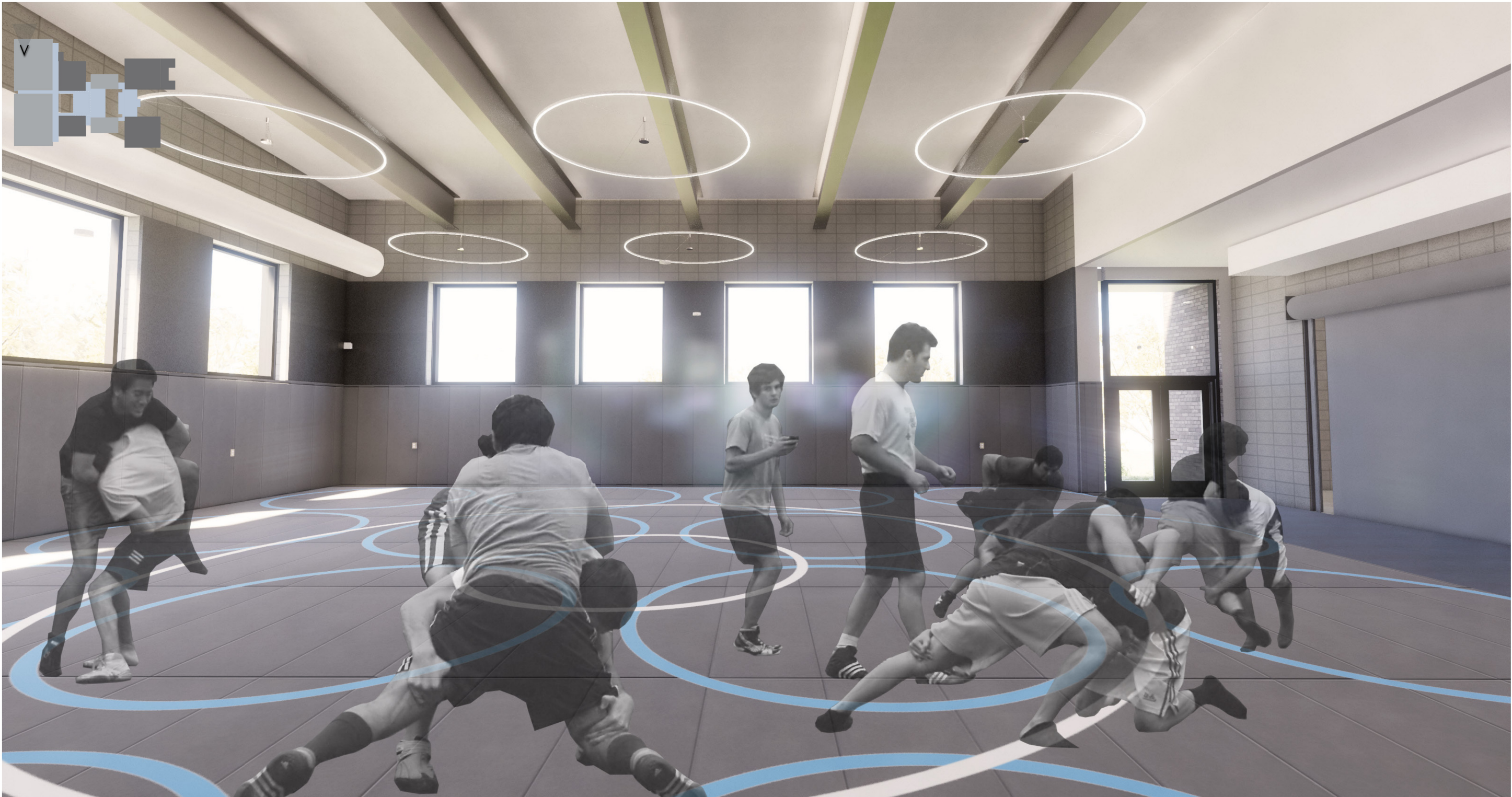
ADRIENNE C. NELSON HIGH SCHOOL