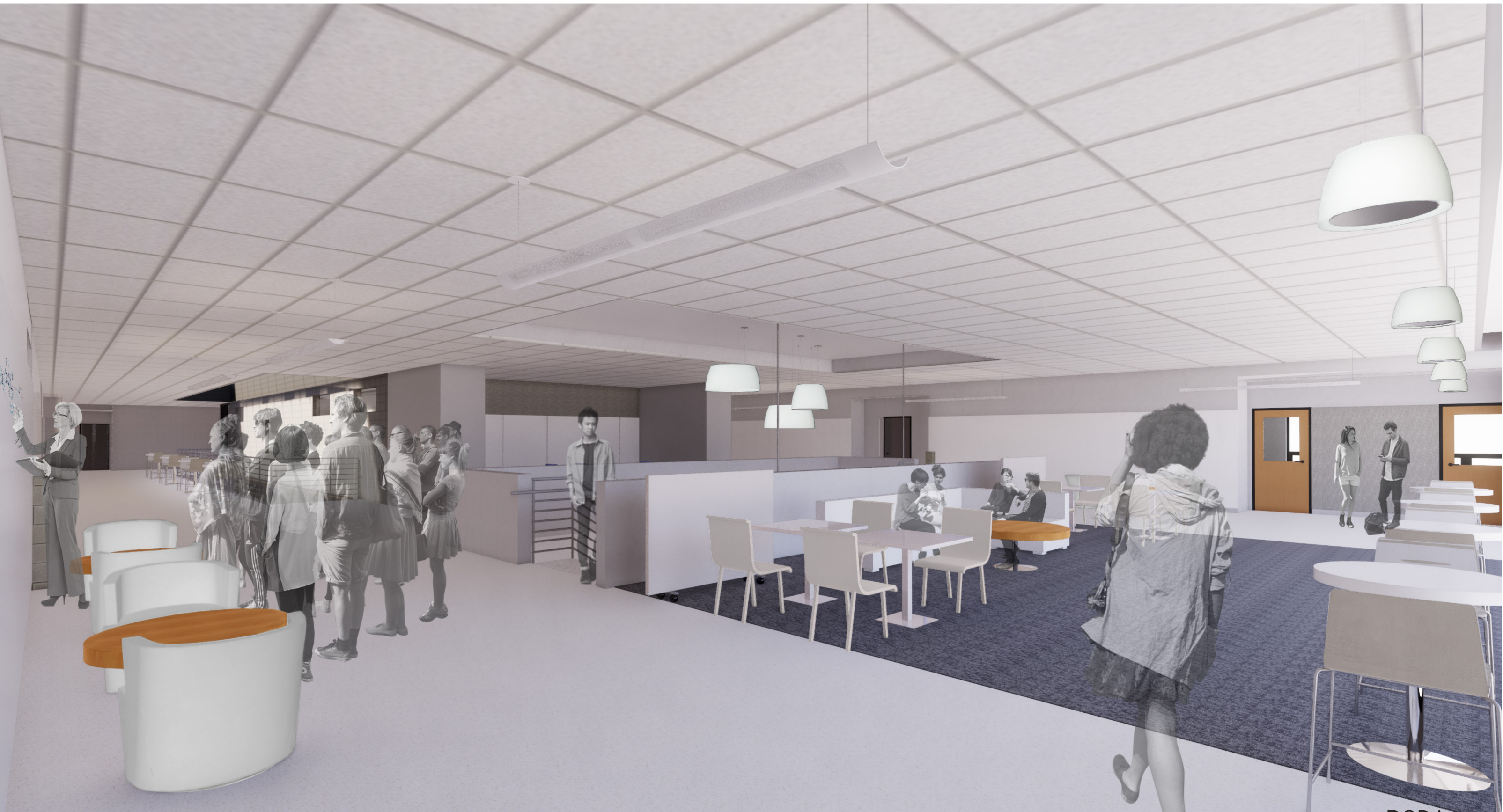
ADRIENNE C. NELSON HIGH SCHOOL