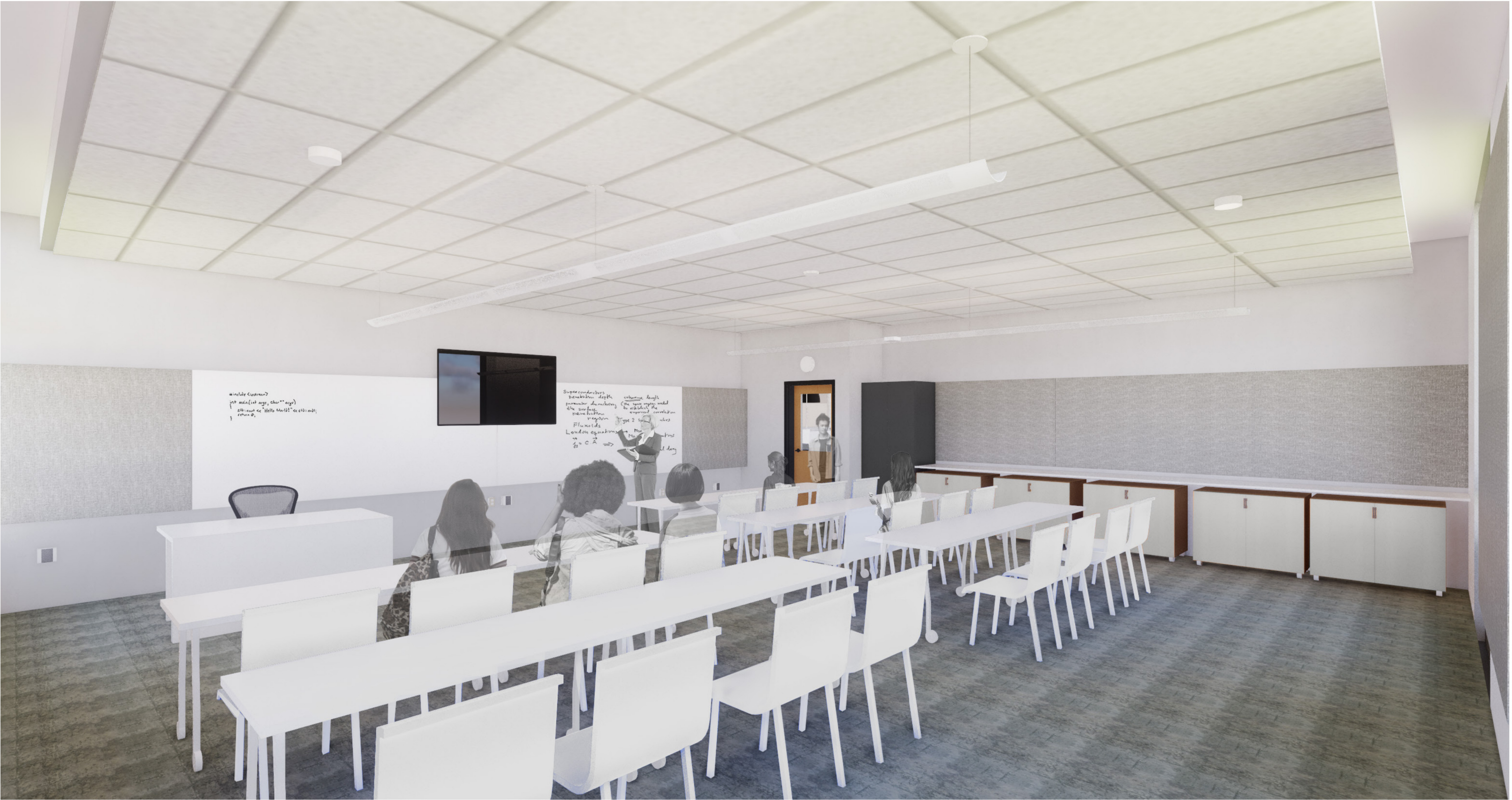
ADRIENNE C. NELSON HIGH SCHOOL