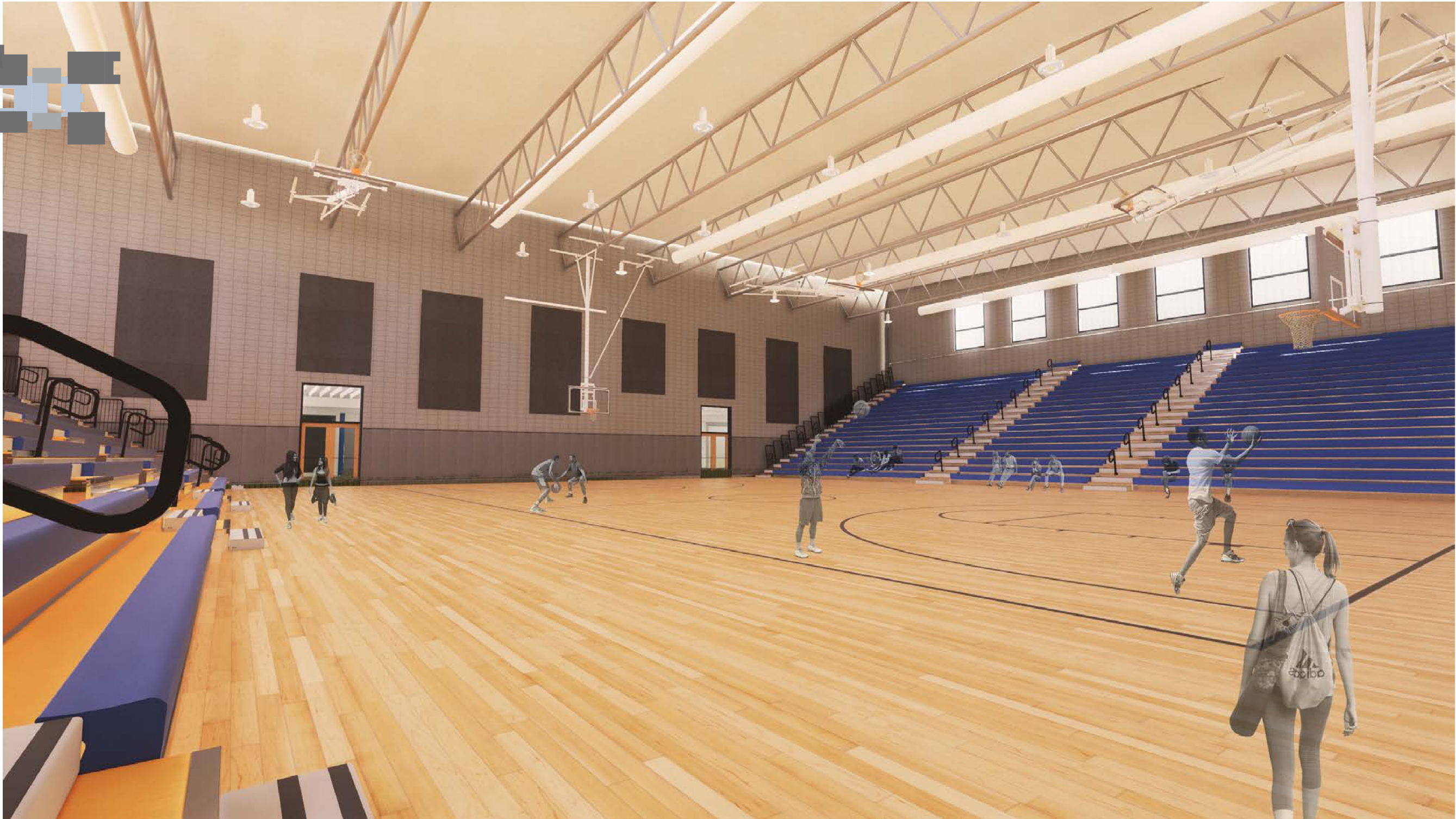
ADRIENNE C. NELSON HIGH SCHOOL