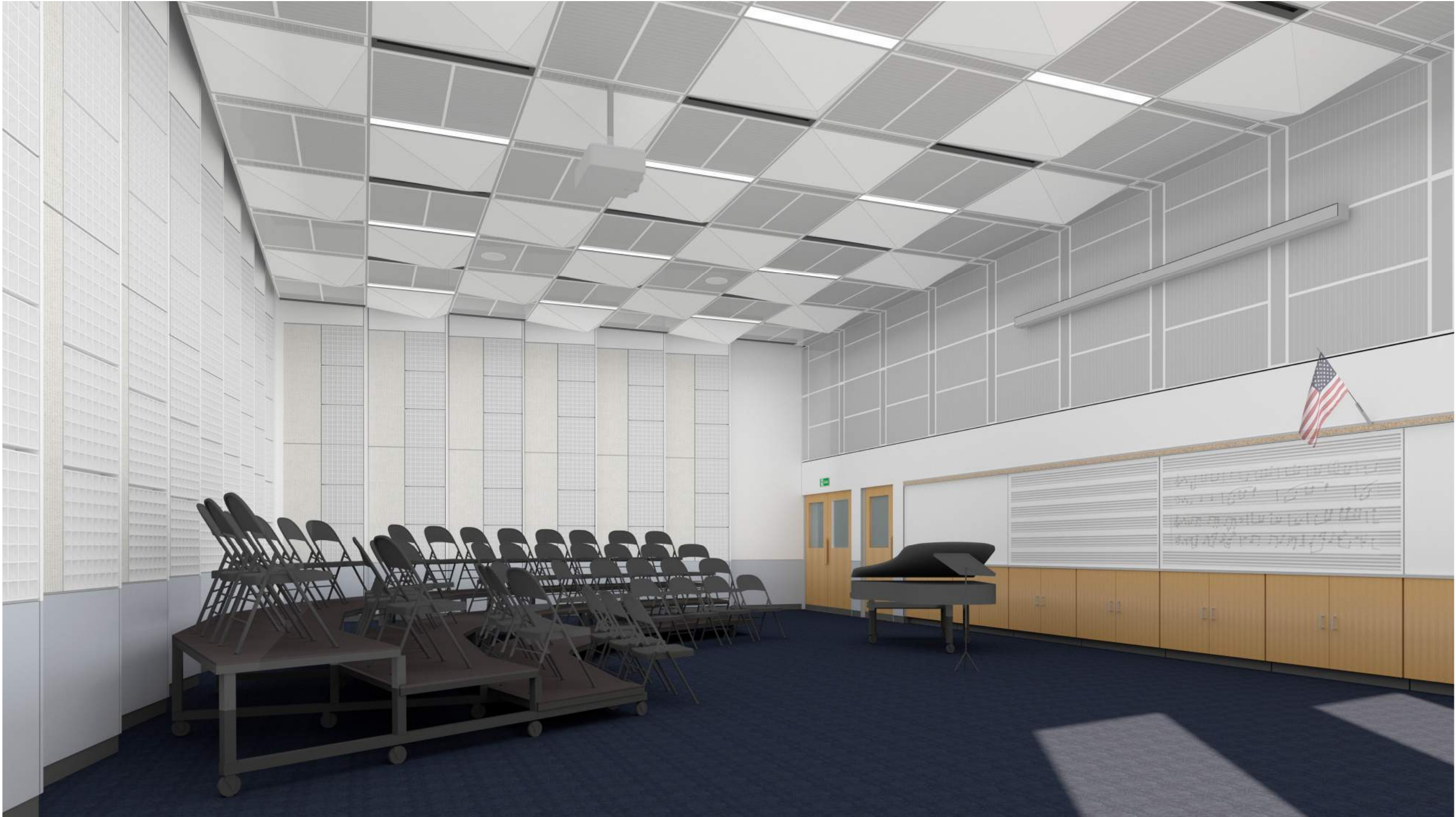
ADRIENNE C. NELSON HIGH SCHOOL