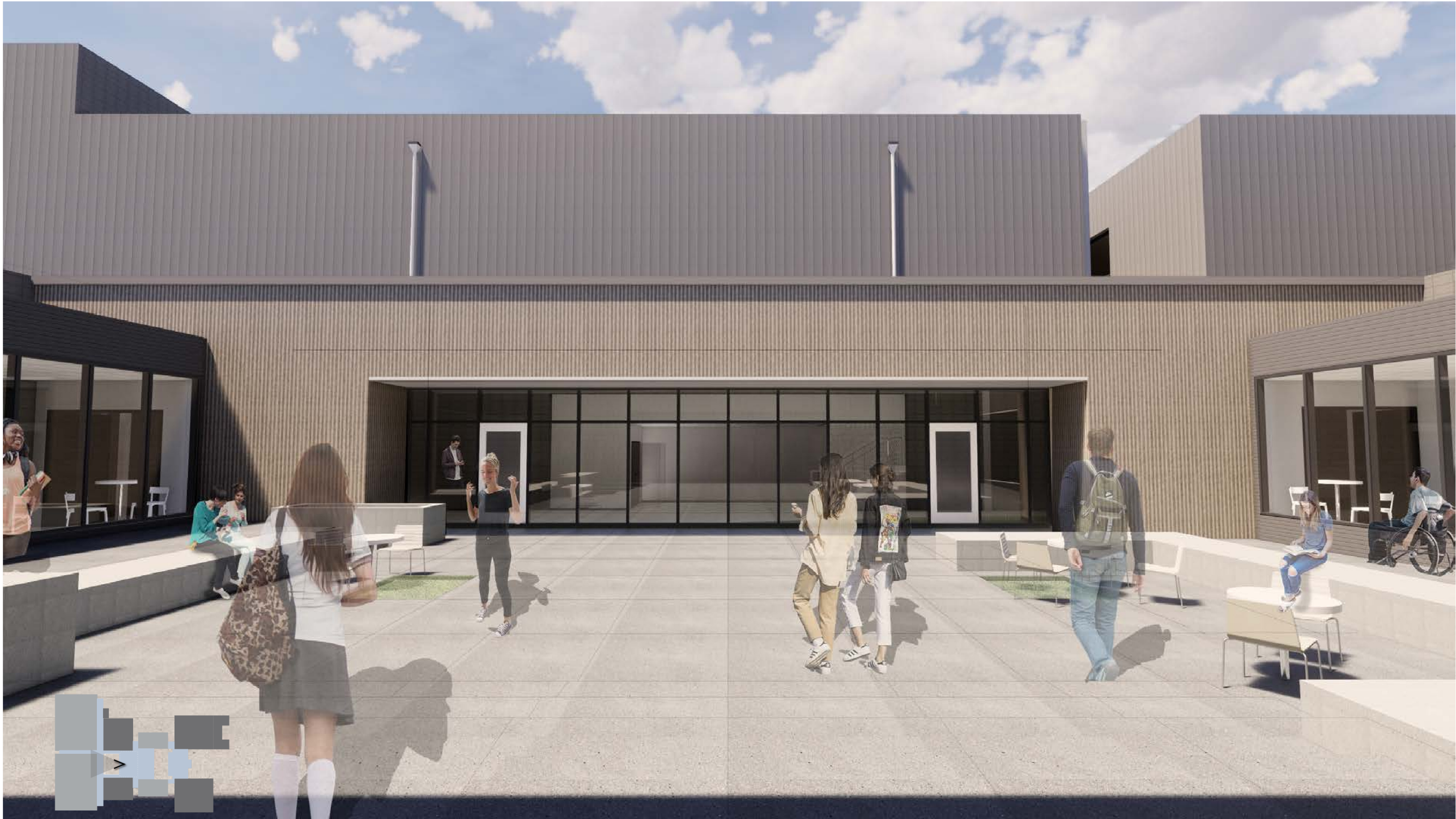
ADRIENNE C. NELSON HIGH SCHOOL