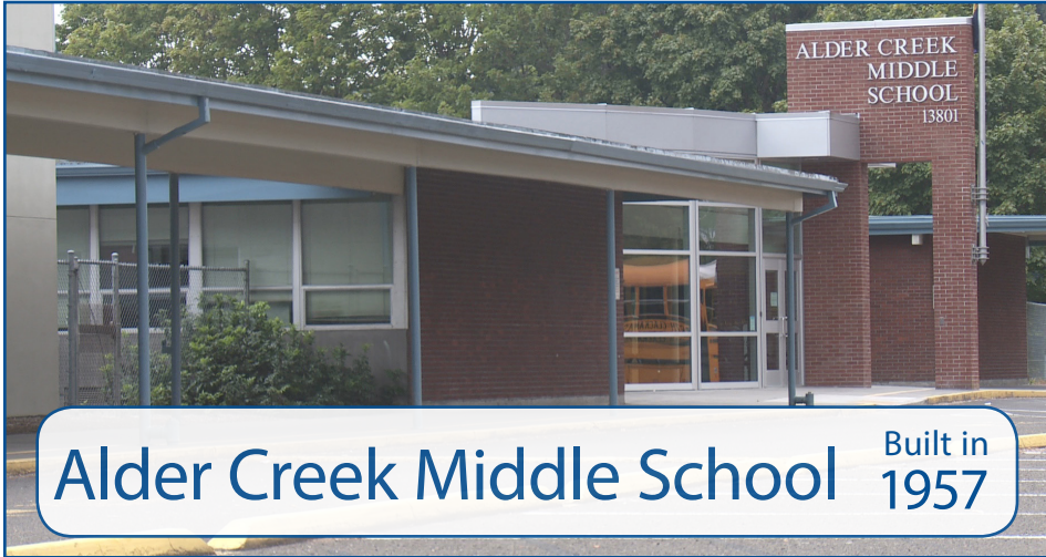
Alder Creek Middle School Built in 1957

If passed, Ballot Measure 3-487 would fund the following projects: