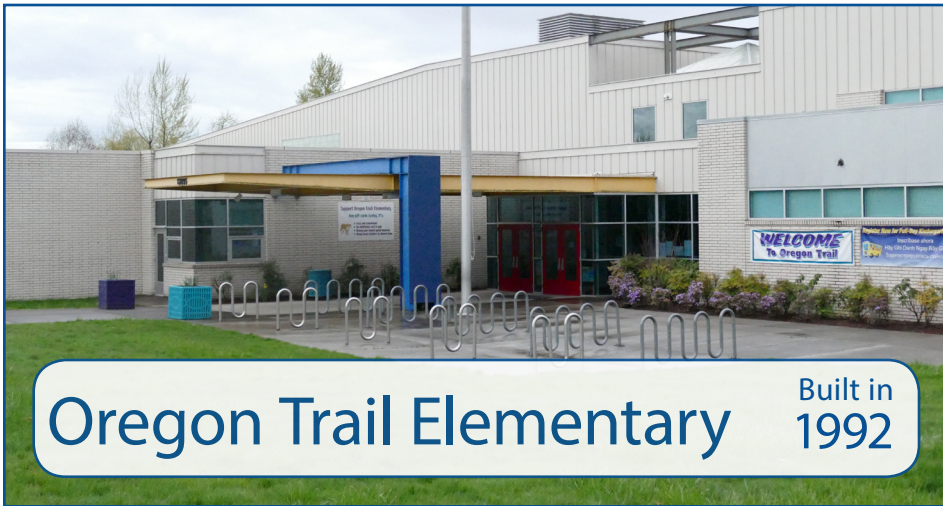
Oregon Trail Elementary Built in 1992

If passed, Ballot Measure 3-487 would fund the following projects: