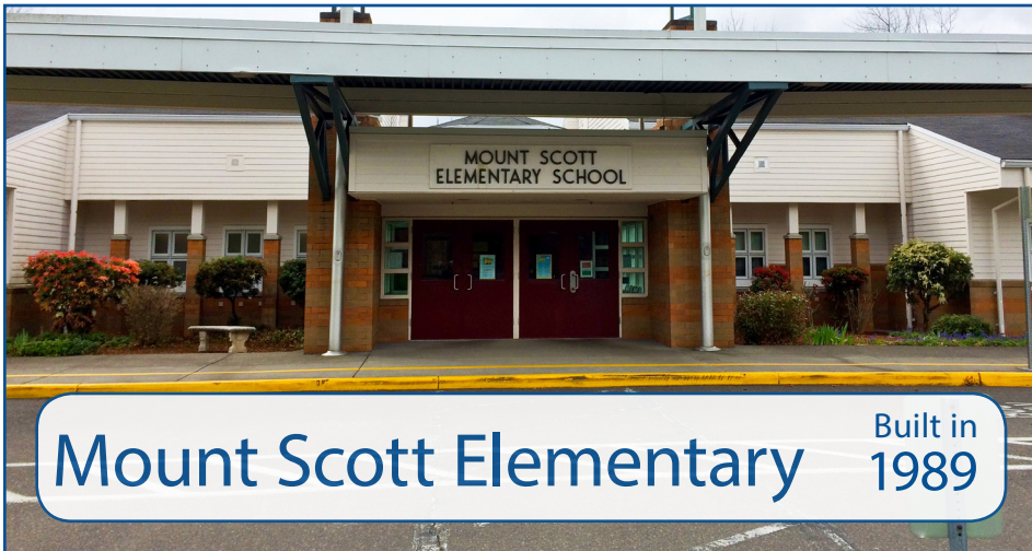
Mount Scott Elementary Built in 1989

If passed, Ballot Measure 3-487 would fund the following projects: