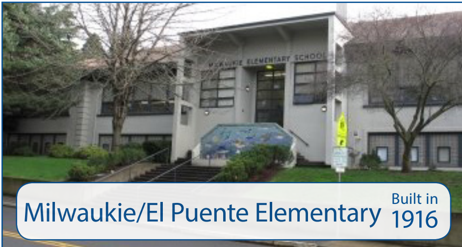
Milwaukie/El Puente Elementary Built in 1916

If passed, Ballot Measure 3-487 would fund the following projects: