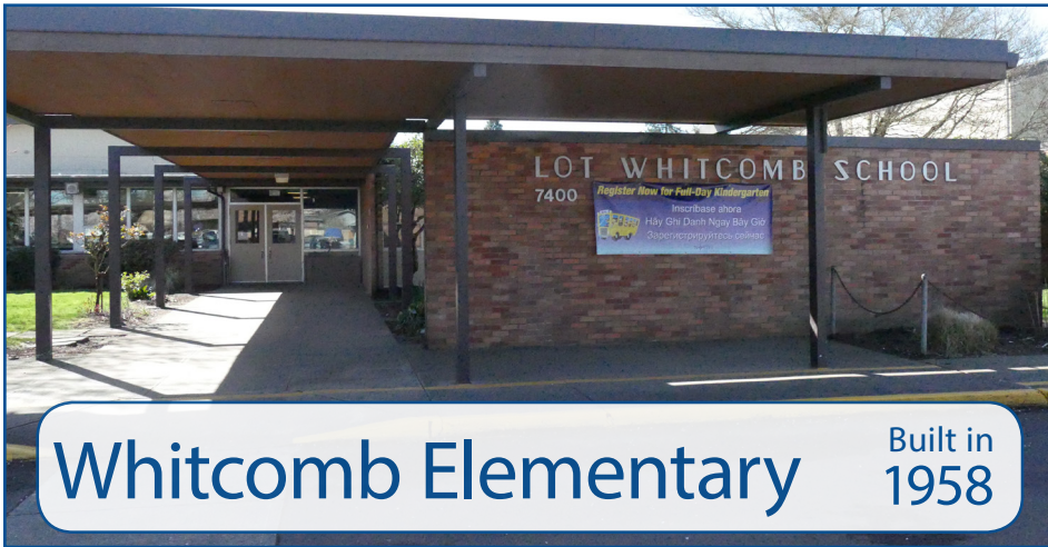
Whitcomb Elementary Built in 1958

If passed, Ballot Measure 3-487 would fund the following projects: