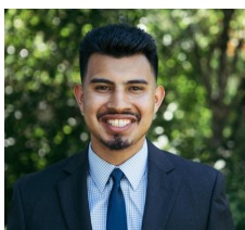
Board Chair Position 1