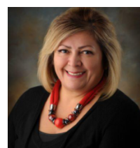
Board Vice-Chair Position 5