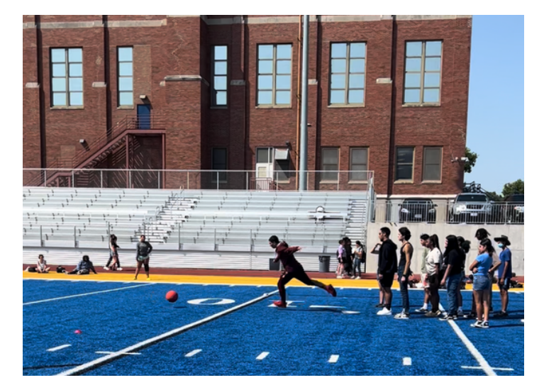
Juniors got competitive with some pick-up kickball on the blue field!