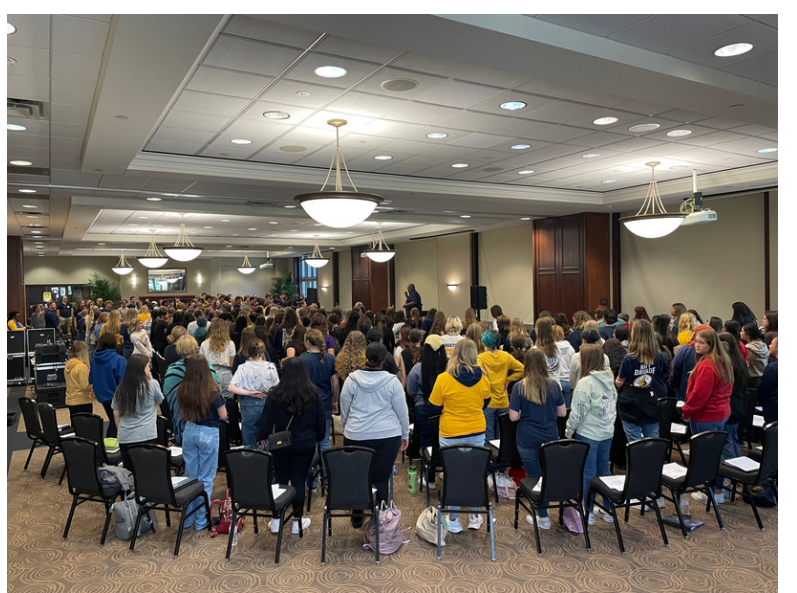
Students learned and performed new music in the same day!