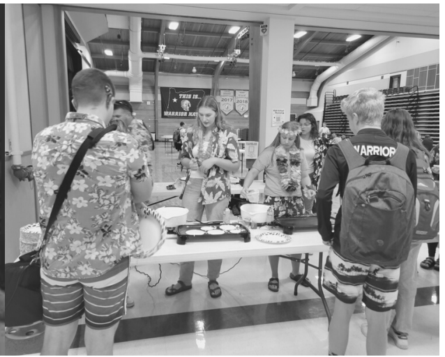
ASB served a pancake breakfast to the student body as part of Homecoming Week on Tuesday morning.