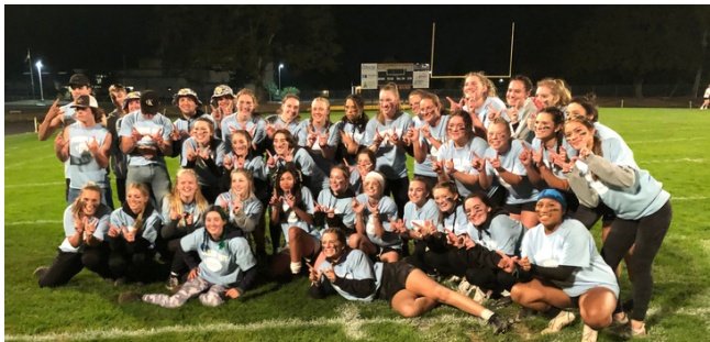
Upperclassmen win the Powder Puff Game Wednesday night.