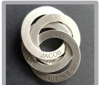
FOUND ON THE GAMES FIELD