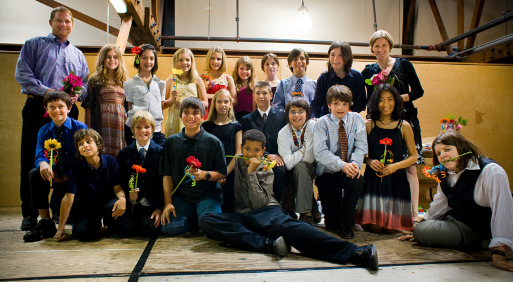
Our 2009 6th year graduates