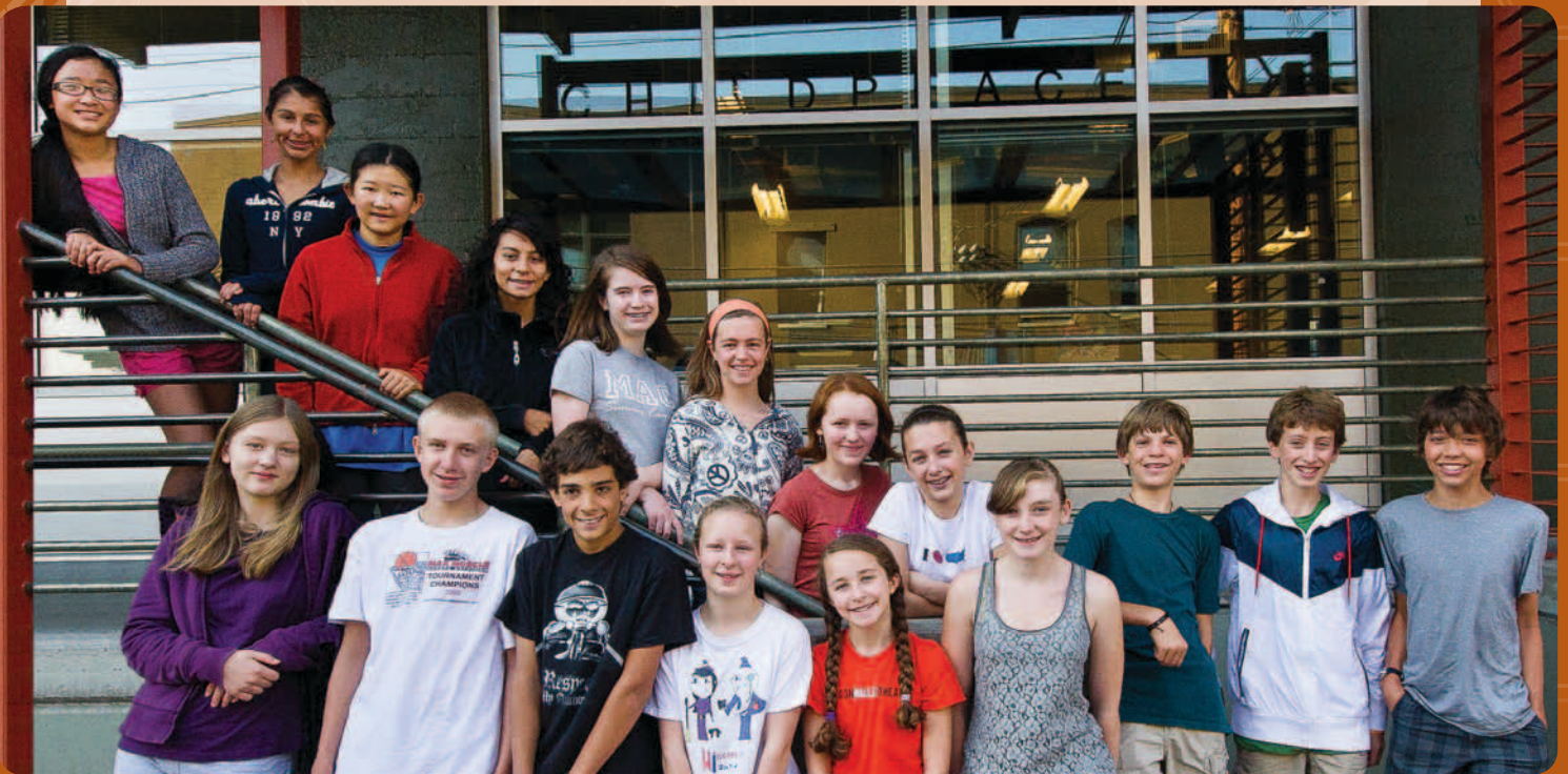
2011-12 Class for Metro Montessori School

The program leaves graduates well prepared for competitive high school programs. Most importantly, our students will begin the journey into adulthood with a community perspective, a body of practical life skills, and competencies in innovation and collaboration.