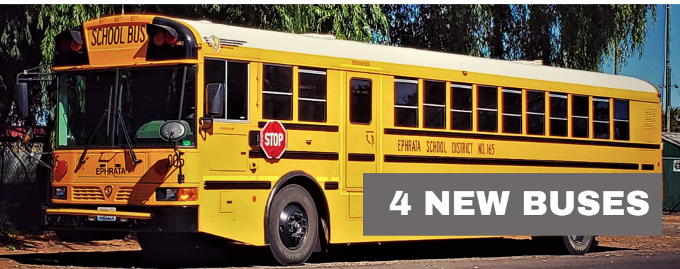
4 NEW BUSES