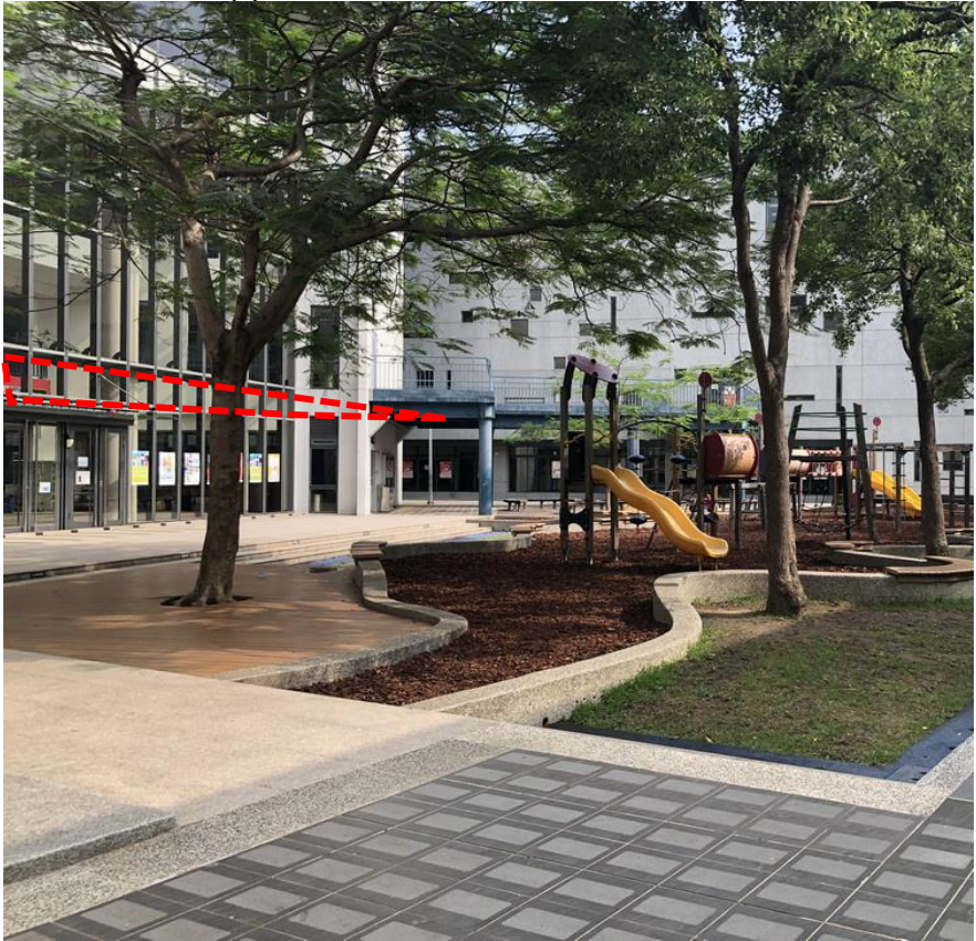
Work 3 Extent the canopy in front of Junior Section building.