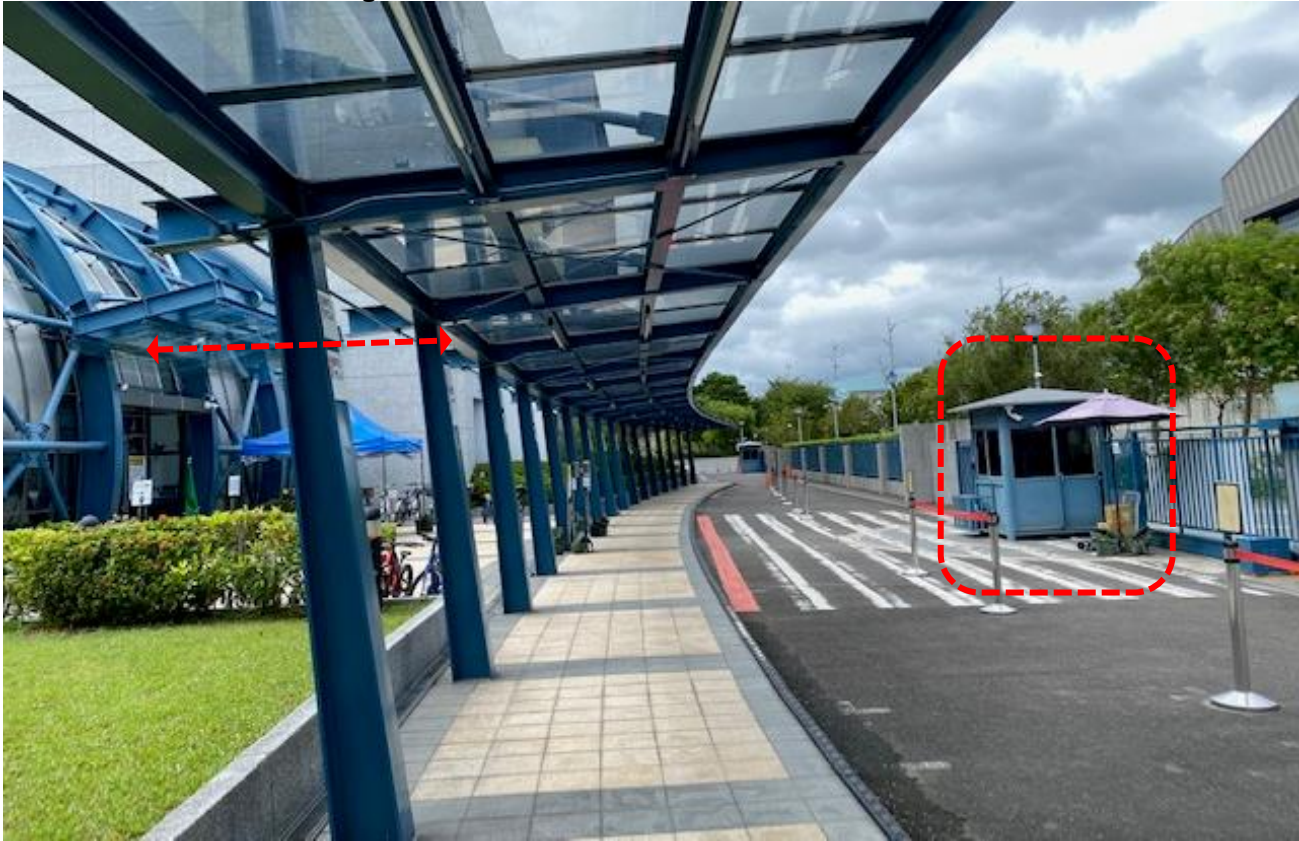
Work 1 A new covered entrance & guard booth.