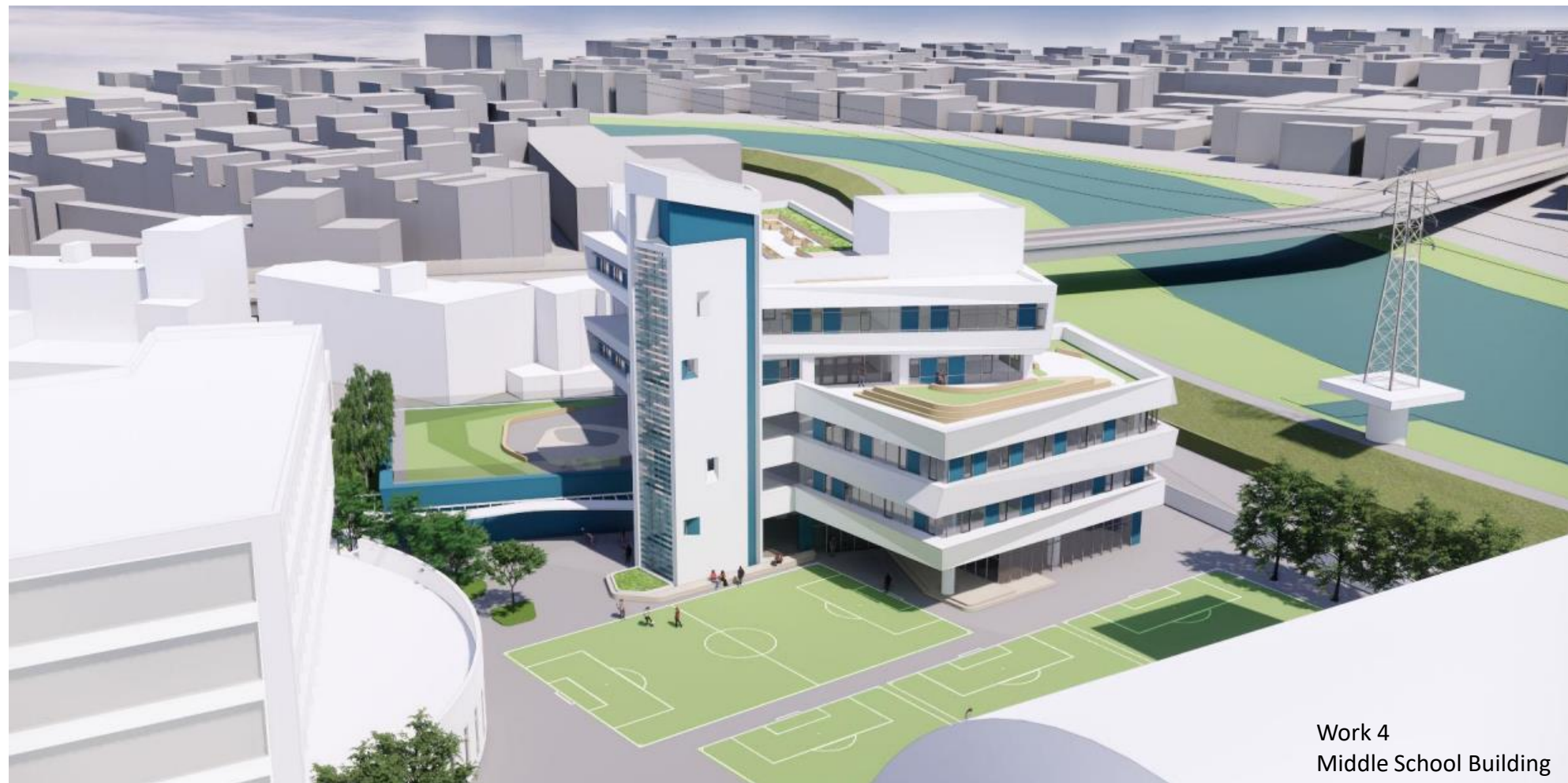
Work 4 Middle School Building