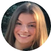
Edited By: Ava Brosseau