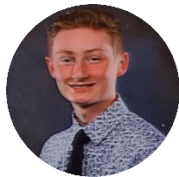
Formatted By: Grant Naese