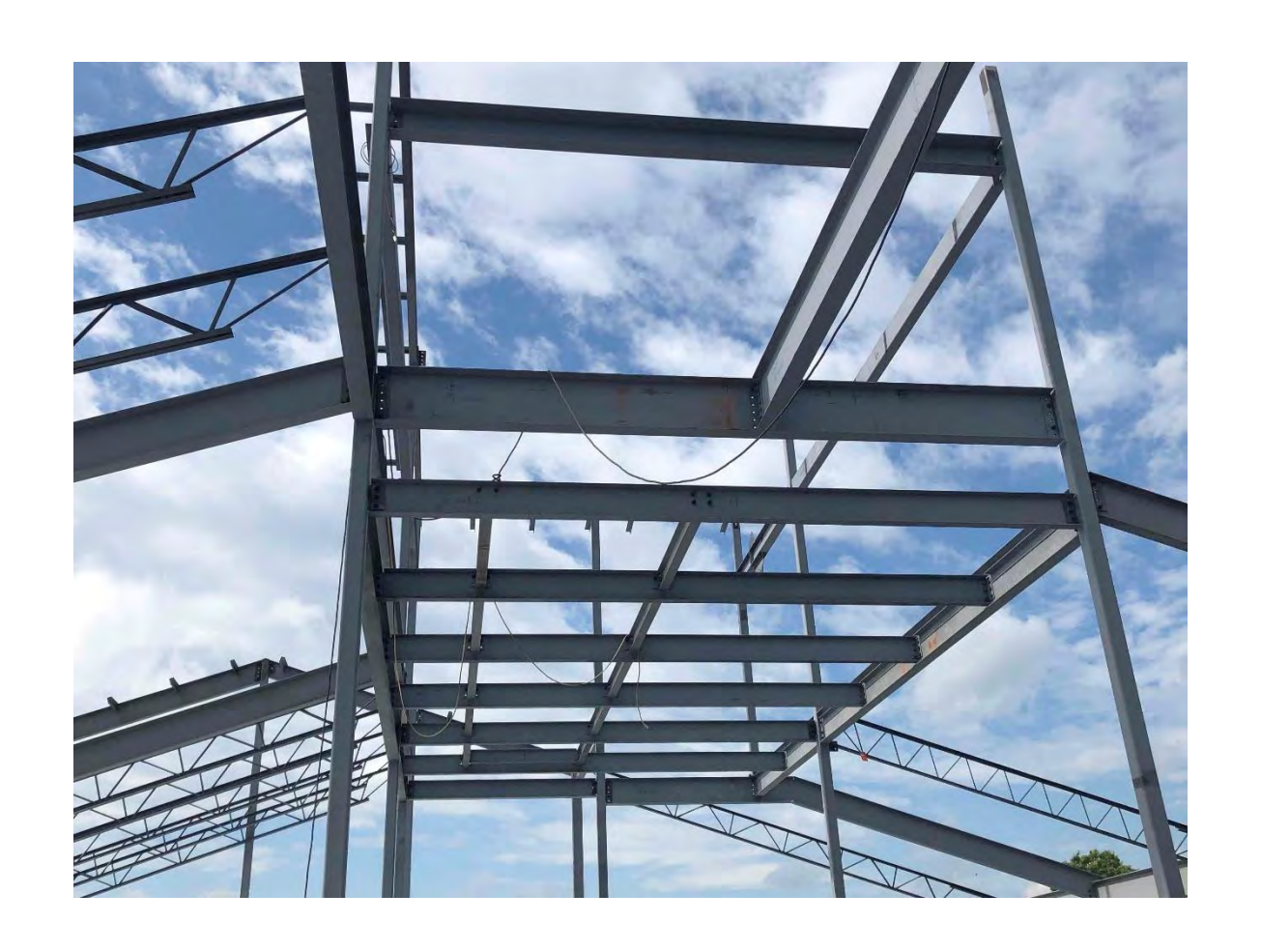
Wendell Cross Project