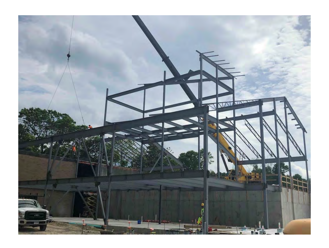
Wendell Cross Project