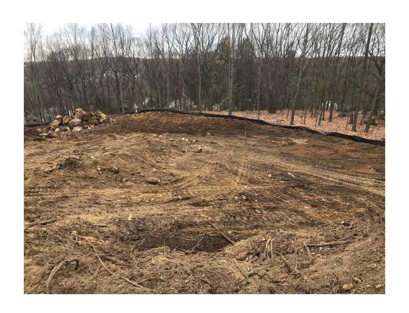
Wendell Cross Project