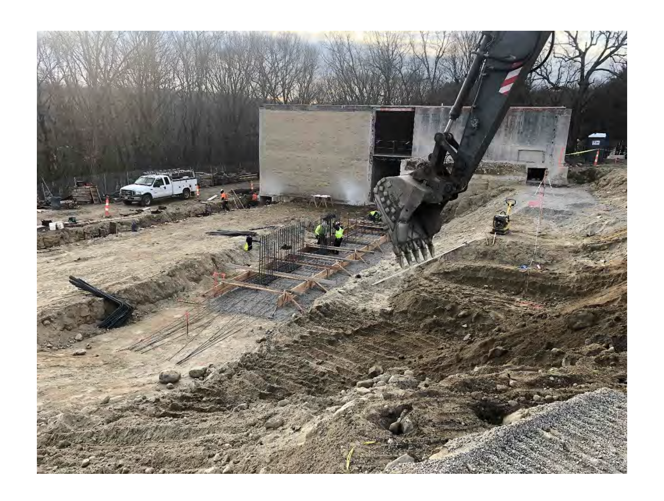
Wendell Cross Project