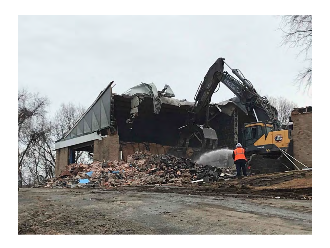
Wendell Cross Project