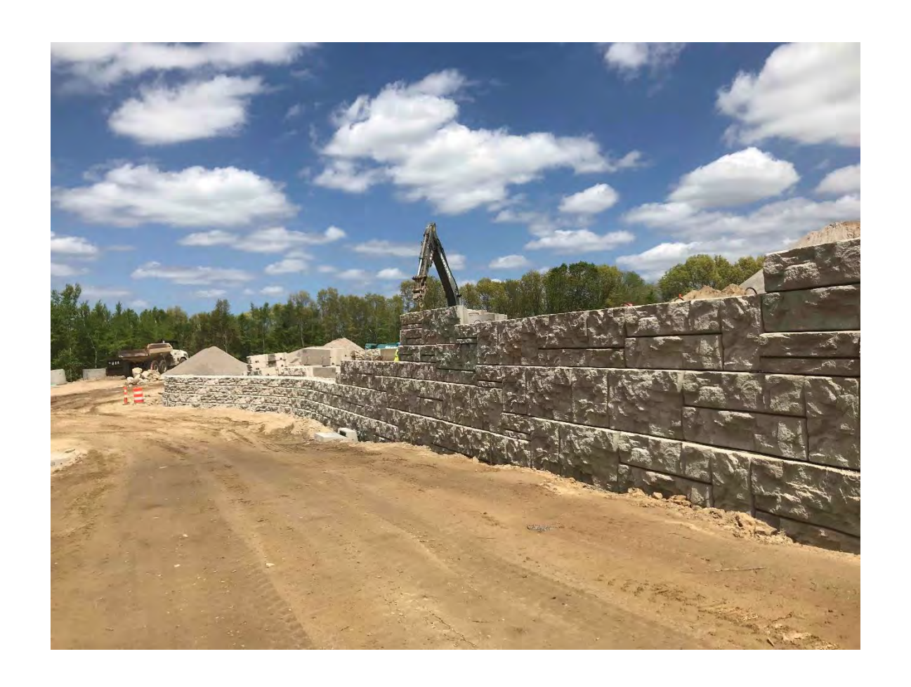
Wendell Cross Project