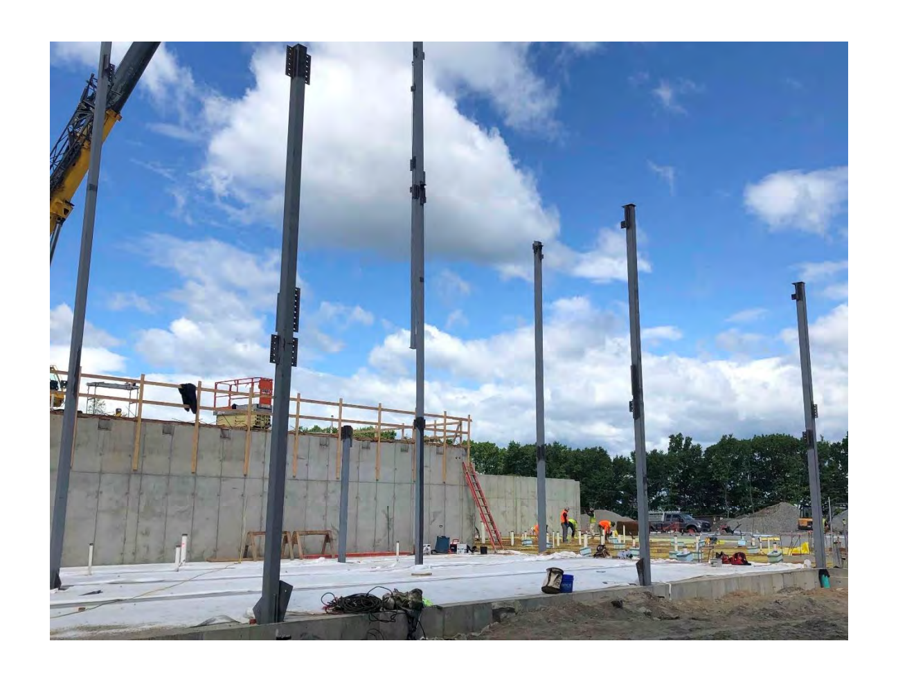
Wendell Cross Project