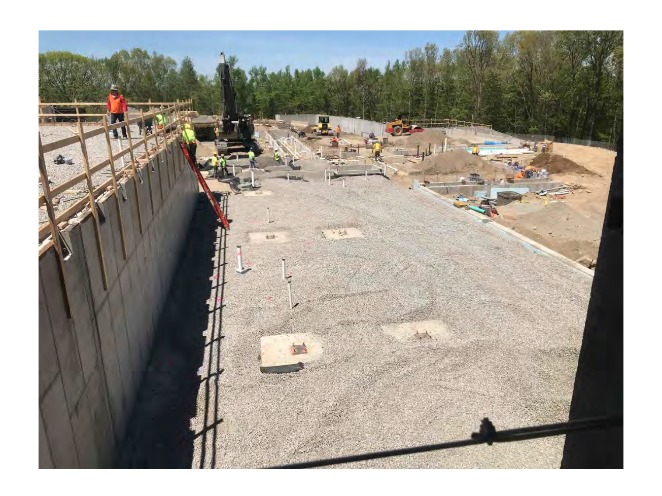
Wendell Cross Project