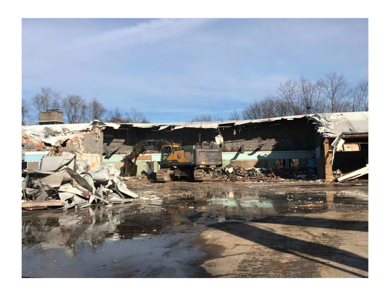
Wendell Cross Project