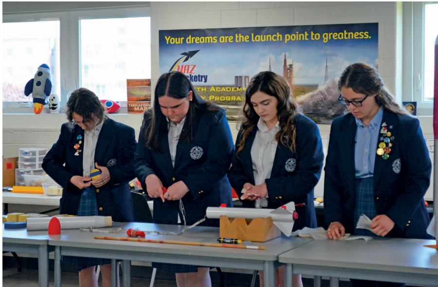
The Nazareth Star Chasers hard at work assembling their rockets in the Innovation Center.

At Nazareth Academy, young women engage in hands-on, interactive experiences that enhance our academic program, promote service learning, and provide opportunities to make interdisciplinary connections in innovative and exciting ways. With more than 40 clubs and activities to choose from, Nazareth offers countless opportunities for students to explore beyond the walls of a classroom and to develop critical leadership skills. Each club and activity caters to students' unique strengths and interests, offering individualized opportunities to grow and excel in their passions.