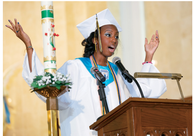
The Class of 2022 celebrating their Baccalaureate Mass in the heart of the school — the Chapel.

Please accept our heartfelt thanks for the important role you play in helping us advance our mission of educating and challenging each of our young women to attain her full potential — academically, spiritually, and personally.