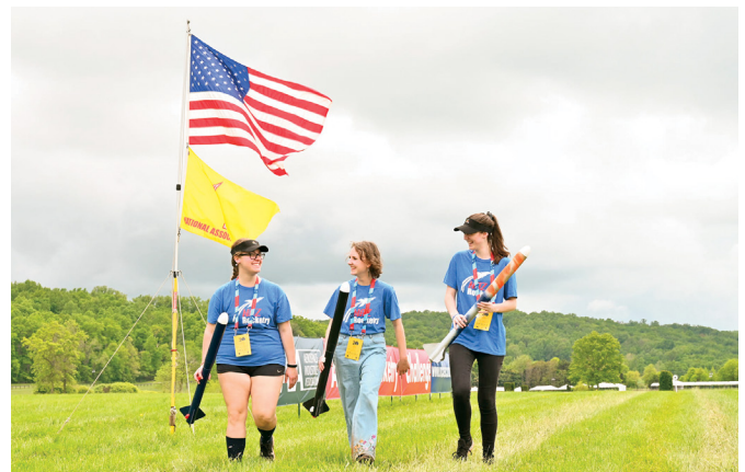
The Nazareth Star Chasers in action at the American Rocketry Challenge — the world's largest rocket contest.

During this visit, the students met with the head NASA Administrator, Bill Nelson, and spoke with him and other NASA officials on their rocketry