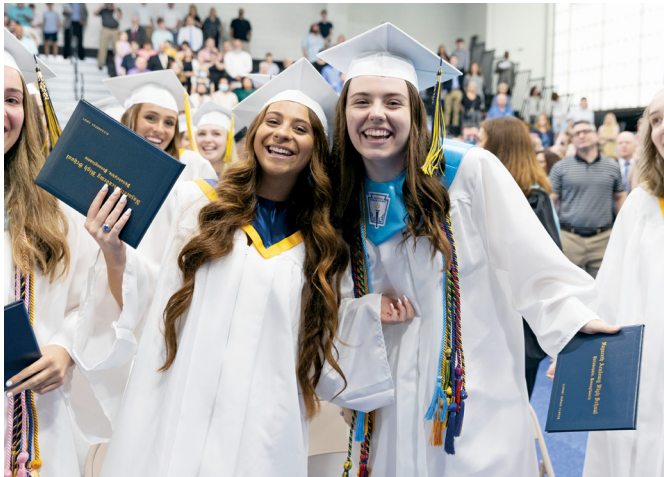
The Class of 2022 earned over $47.4 million in college scholarships and grants.

Attend 54 different colleges and universities across the country