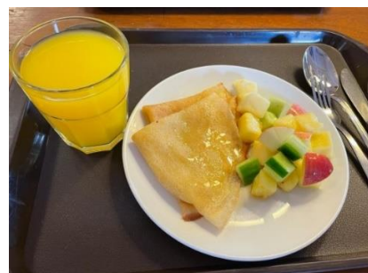
prepared by College kitchen

c. An Easter Pancake Breakfast and Gathering for reconciliation, unity and peace was organized.