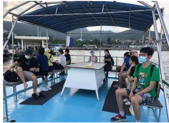
On the Squid-boat going to the bay at the foot of HKUST

d.. After months of lockdowns, ZOOM classes and exams, a day of boat-trip to the Geopark, the Salt pans, and Squid-fishing was organized to get students out into the fresh open space of Saikung Park.