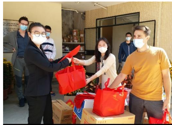
Distributing love and hope laisee packages

b. A morning of praise and prayer for peace and reconciliation was organized in a joint programme with brothers and sisters from Union Church during Hong Kong's self-searching difficulties