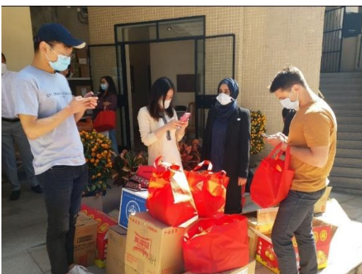
Sending out messages of love and hope

a. Taoist-Buddhists, Christian and Muslim students distributing Love and Hope Lucky Laisee packages to undergraduates and postgraduates