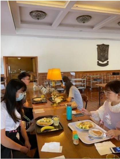
Undergrads and postgrad Easter breakfast

d.. After months of lockdowns, ZOOM classes and exams, a day of boat-trip to the Geopark, the Salt pans, and Squid-fishing was organized to get students out into the fresh open space of Saikung Park.