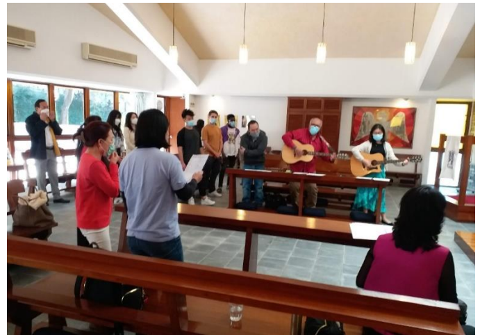
With brothers and sisters of Union Church, Kowloon

b. A morning of praise and prayer for peace and reconciliation was organized in a joint programme with brothers and sisters from Union Church during Hong Kong's self-searching difficulties