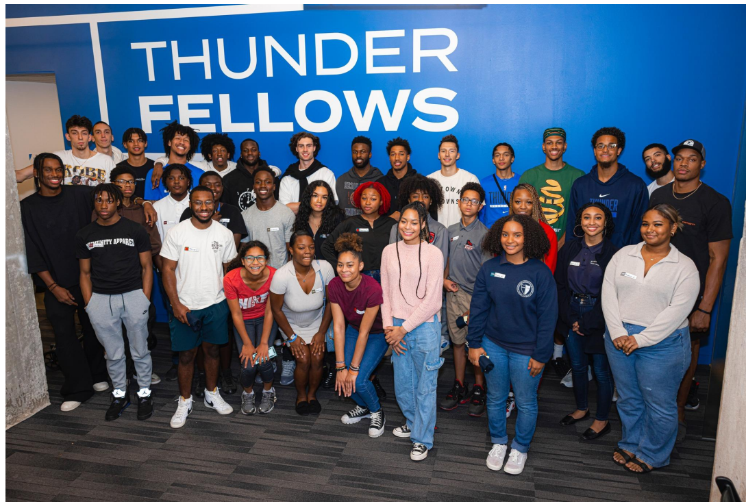
2022-23 Thunder Fellows