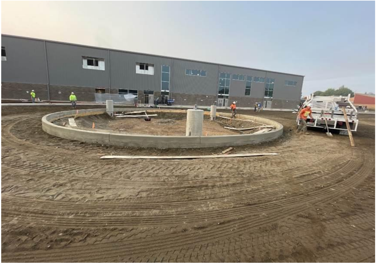
Final prep work for asphalt in the new bus loop north of the new building