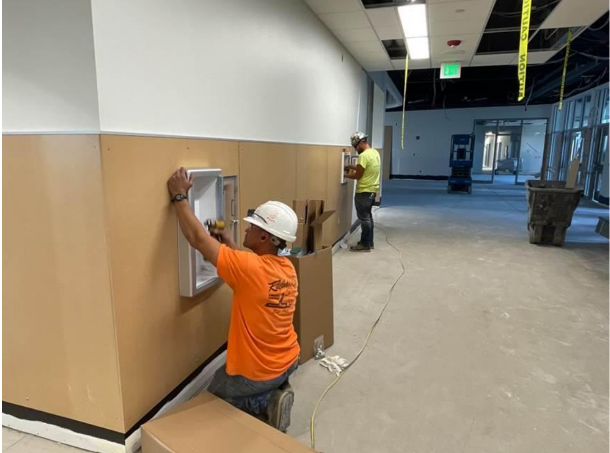
Fire extinguisher cabinet installation on the first floor corridor