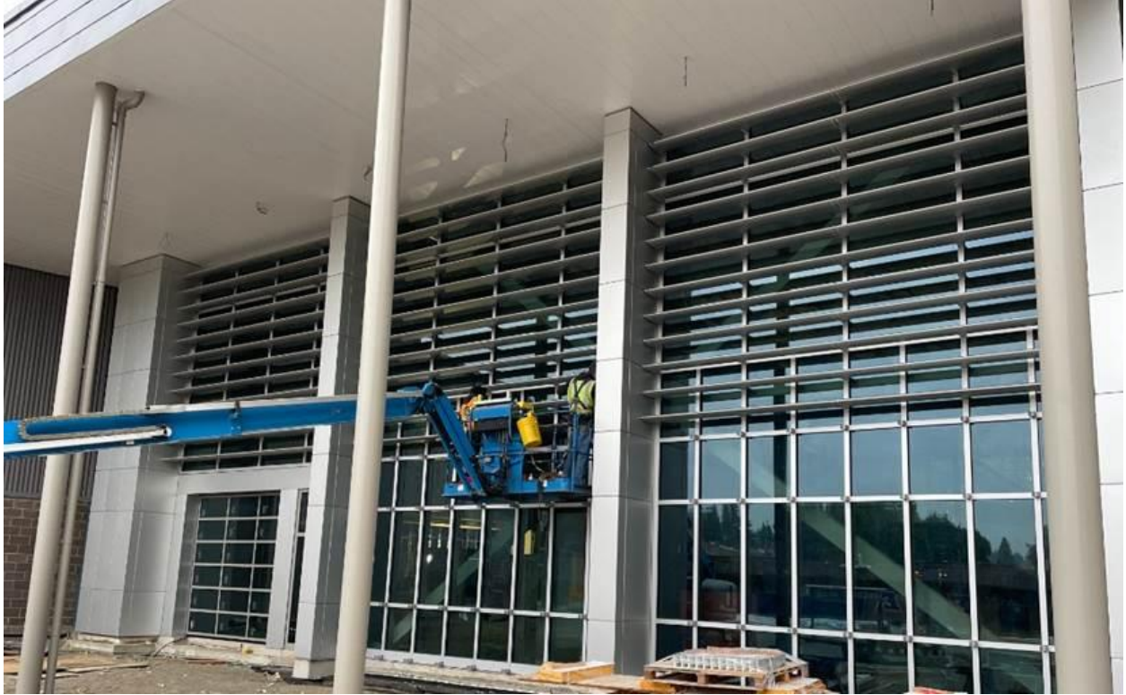
Sunshade installation on the commons area window wall that faces the west