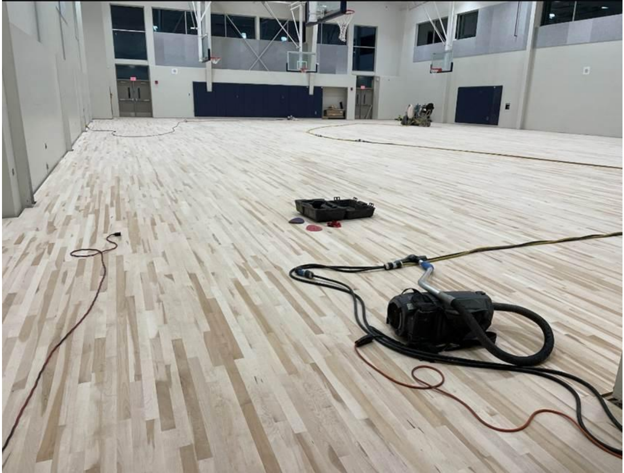
Final sanding of the wood flooring in the Auxiliary Gym