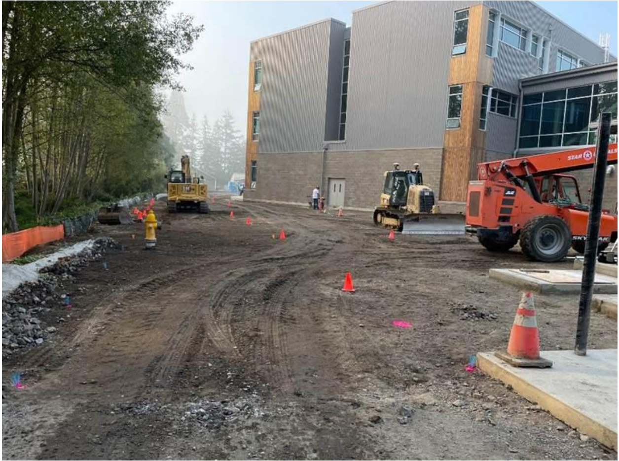
Final prep work for asphalt in the service yard east of the new building