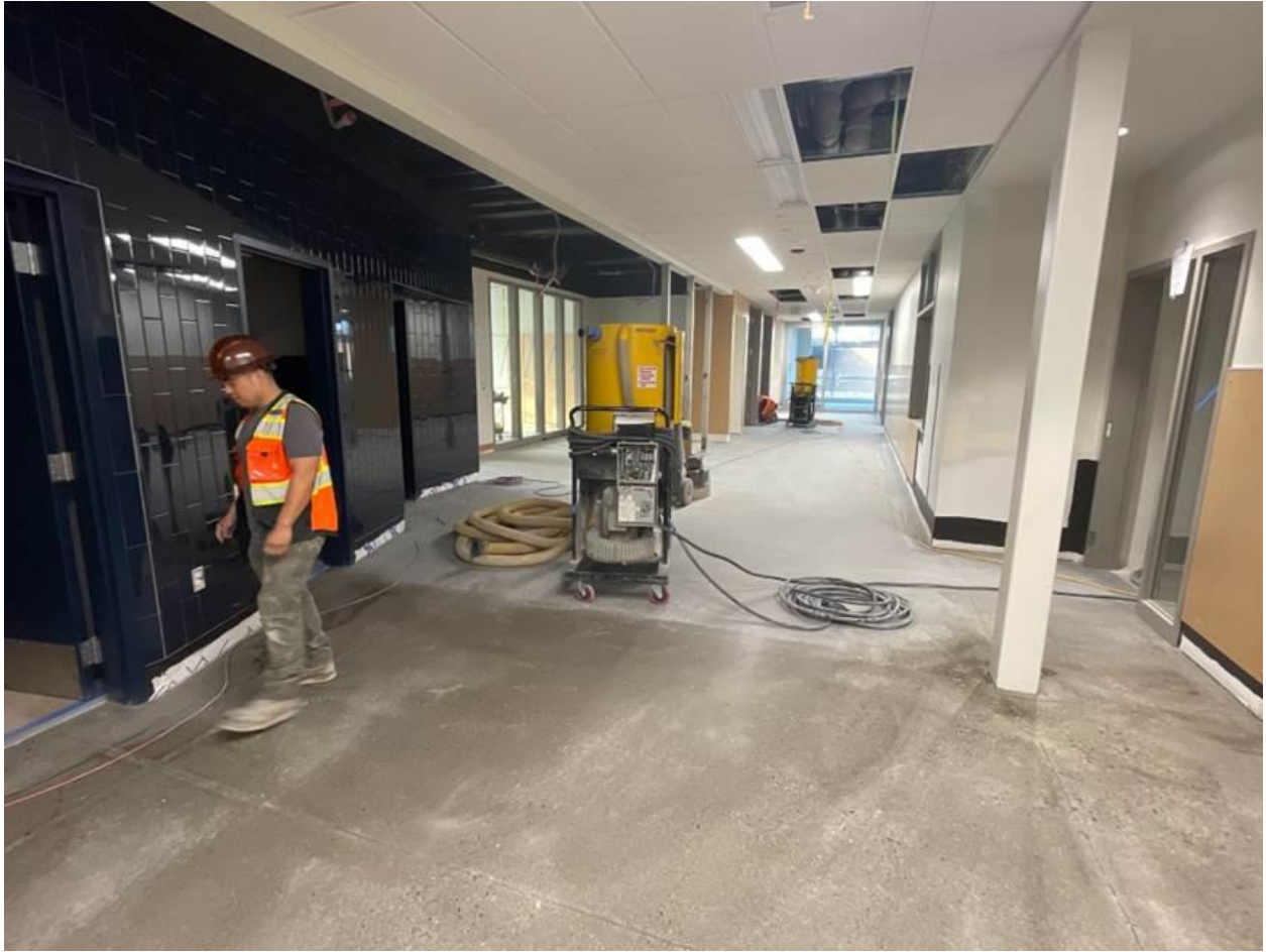
Concrete grinding and polishing of the Level 1 corridors