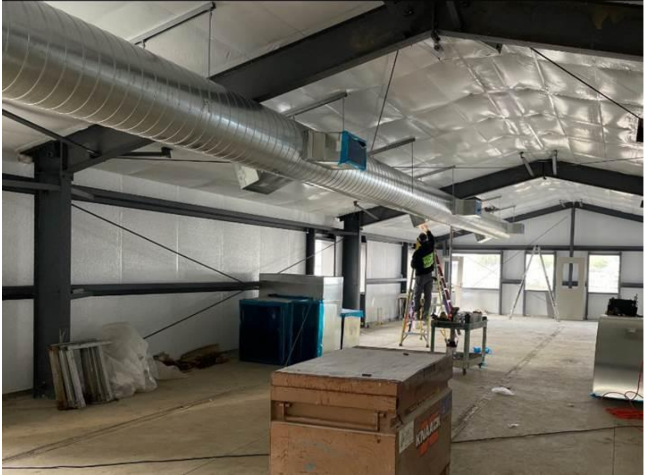
Ductwork installation in the Aquaculture Building