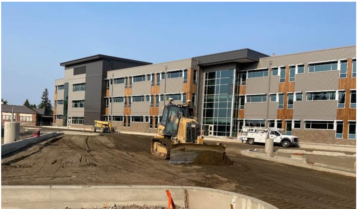
Final prep work for asphalt in the parking lot south of the new building