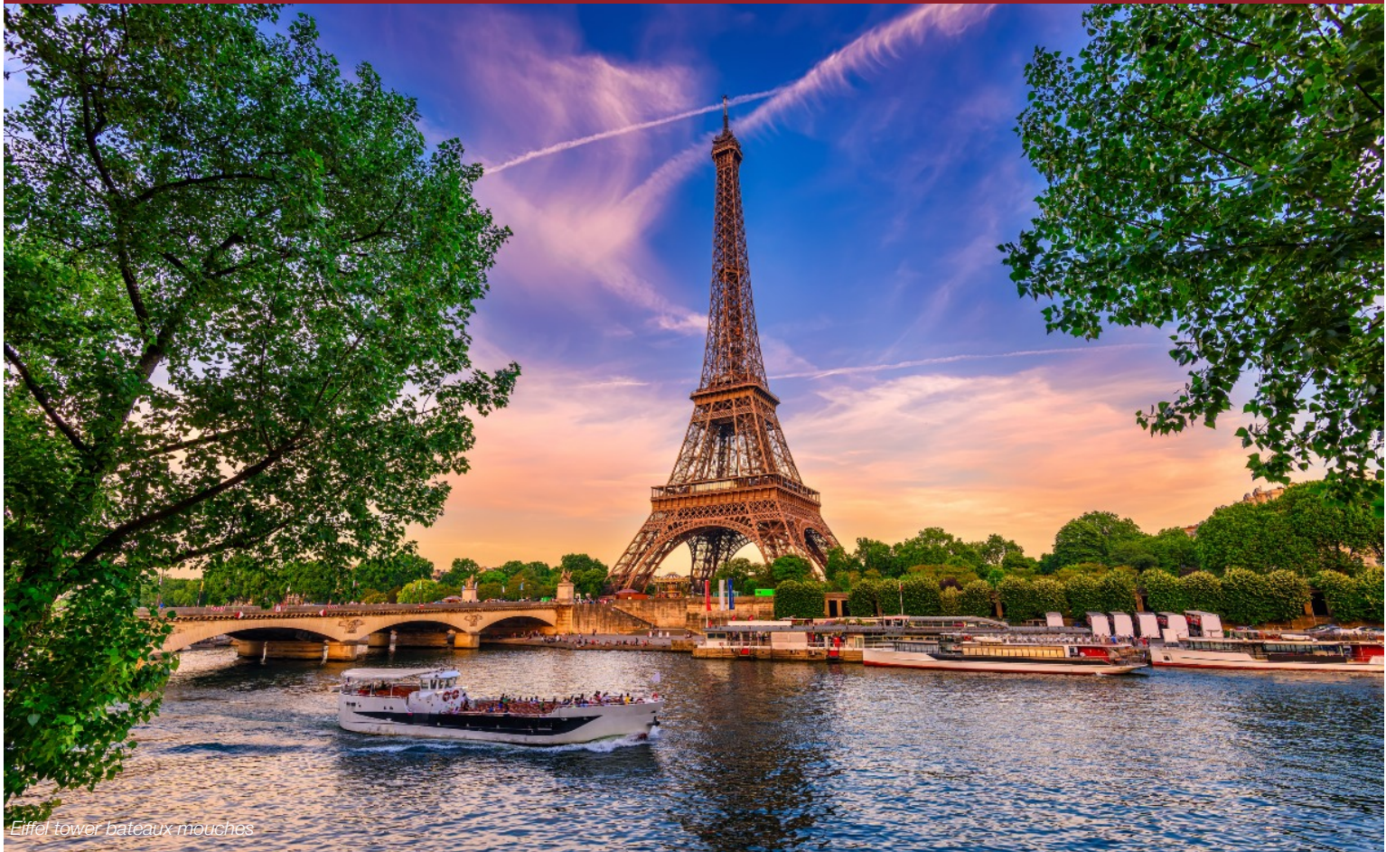
Eiffel tower bateaux mouches