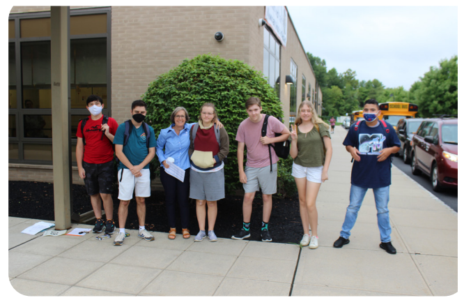
Ready for our first day!