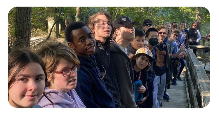
Juniors on Cheesequake Park Field Trip

We are excited to announce that we are starting our annual Holiday Wreath Sale in late October. We will also conduct our Student Interest Meeting in October as well. The FBLA State Conference in Atlantic City is scheduled to be held on March 6-8, 2023. More information will be sent out in the coming weeks.