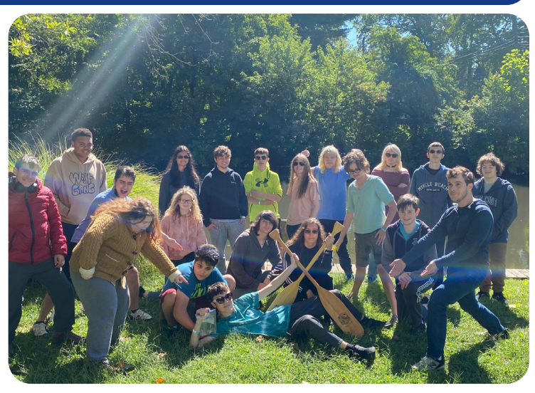
Senior Class Canoe Trip