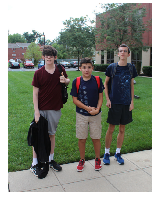
First Day at NHS