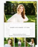
Deco Pattern - Gradua... Graduation Cards From $17.25 Sold in sets of 25