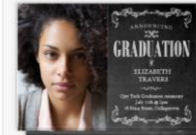
Classic Scrollwork - G... Graduation Cards From $17.25 Sold in sets of 25