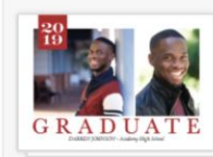
Classic Banner - Grad... Graduation Cards From $17.25 Sold in sets of 25