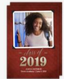
Picture Perfect - Grad... Graduation Cards From $17.25 Sold in sets of 25