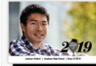
Graduation Party Time... Graduation Cards From $17.25 Sold in sets of 25

Anuncios también disponibles a través de Costco, Shutterfly, etc.