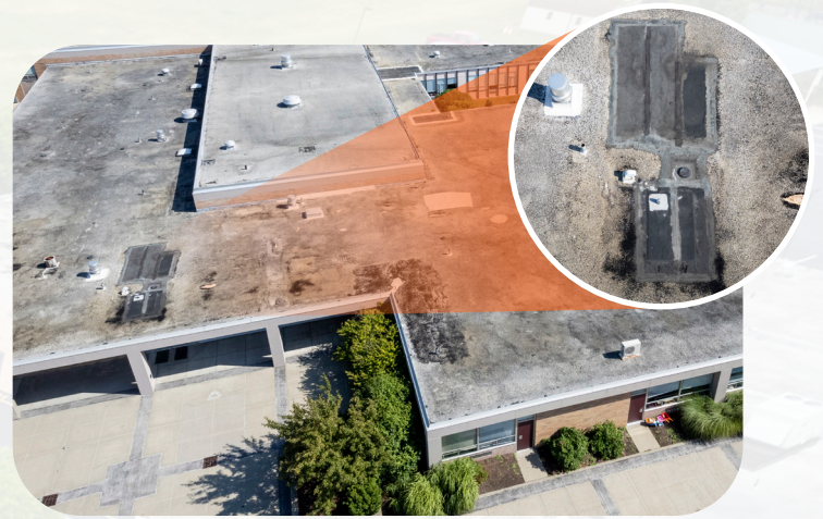
Temporary repairs on a 50-year-old roof on the Axelrod building.