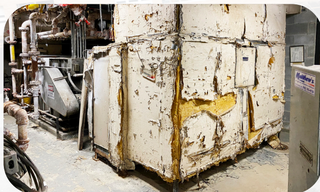
Deteriorating and outdated mechanical equipment.