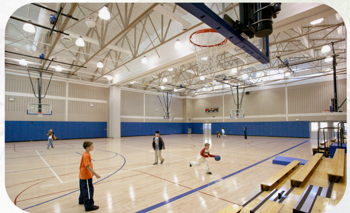
A representation of the new gymnasium planned at the Arden Hill Campus.