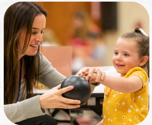
Not all students learn the same way, and Orange-Ulster BOCES Special Education programs provide for the needs of nearly 1,000 special learners each year.

We encourage you to participate in this vote on Tuesday, Oct. 25, 2022, from 12pm to 8pm.