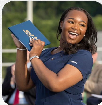
CTE students participate in academic and hands-on instruction that provide them with skills demanded by the labor market while preparing them for post-secondary degrees or entry into the workforce.