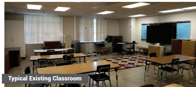
Typical Existing Classroom