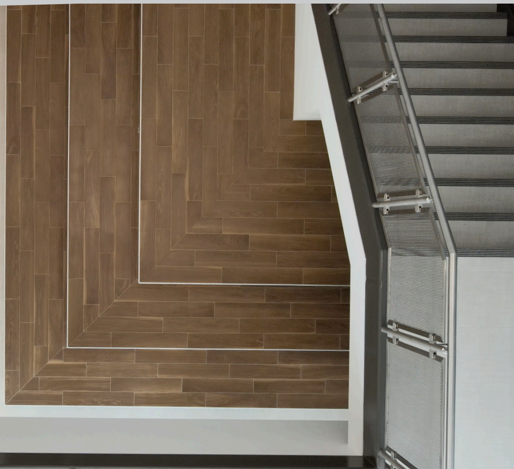
Northbrook High School