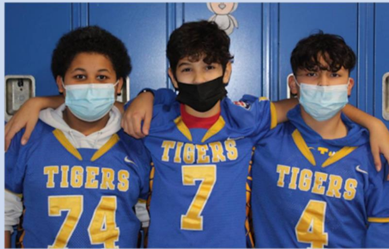
Goal 2: Climate and Culture