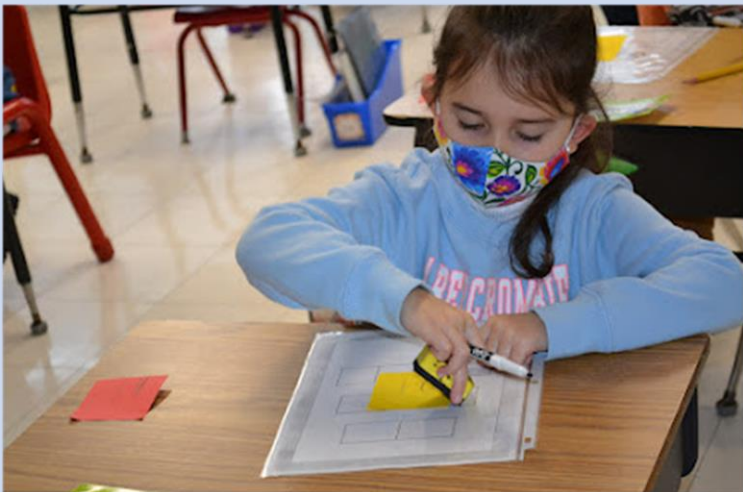
Goal 1: Student Engagement with Curriculum