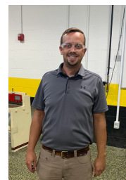
Mr. Baden Welding & Machining