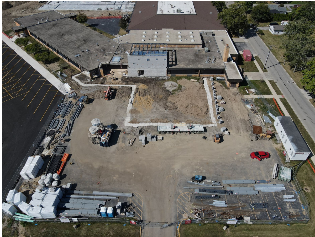
Gymnasium Addition Footings