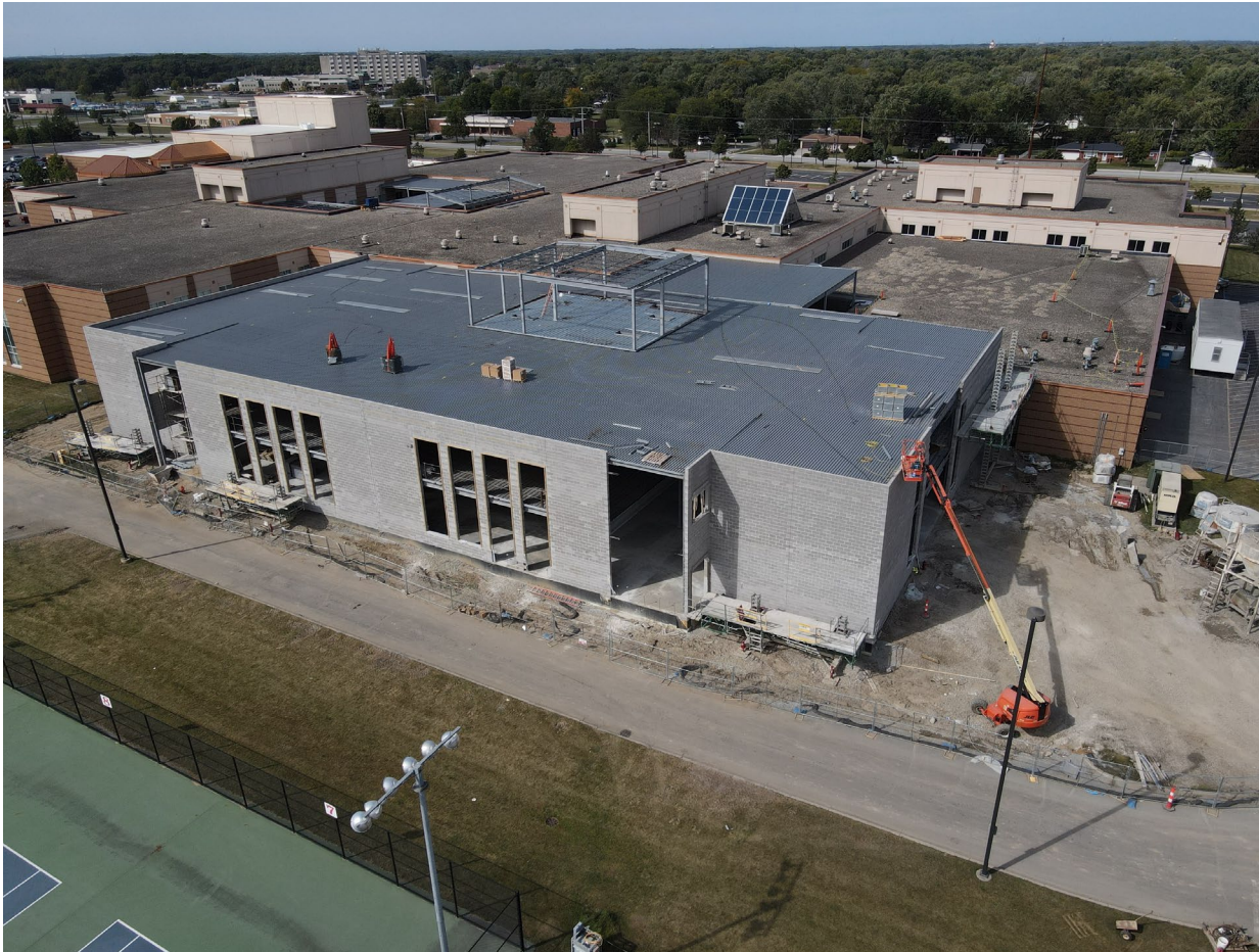
Classroom Addition CMU Walls