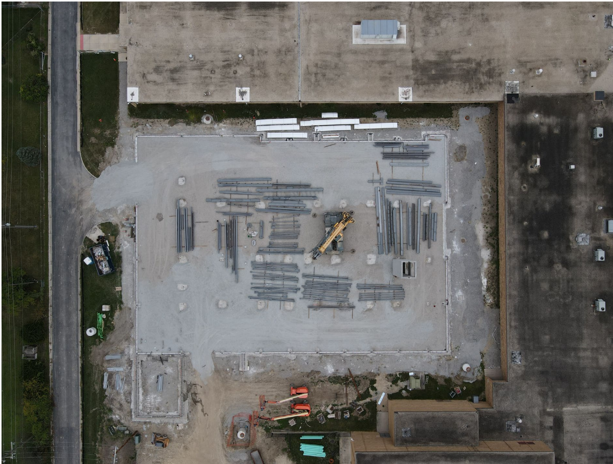
New Administration Center Overhead