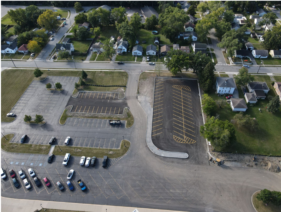
New South Parking Lots