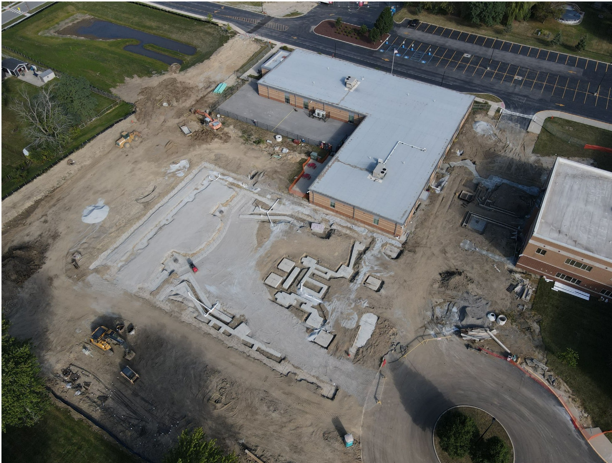
Auditorium Addition Footings