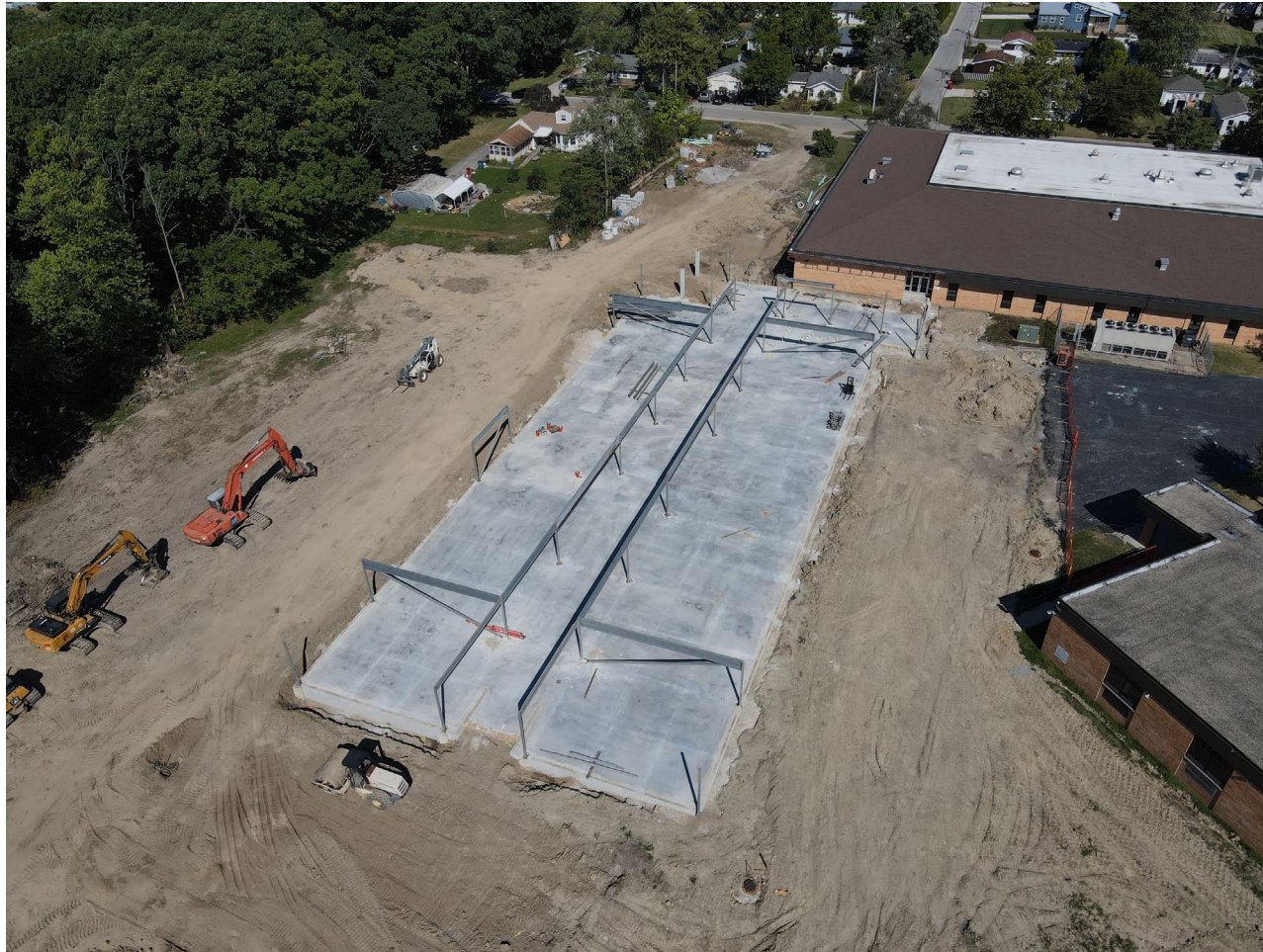
Classroom Addition Structural Steel