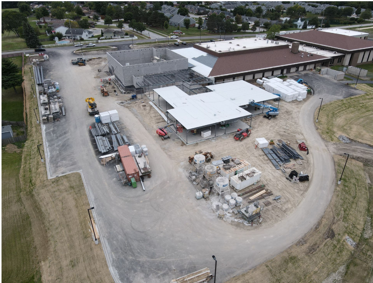
Pre-K and Gymnasium Addition