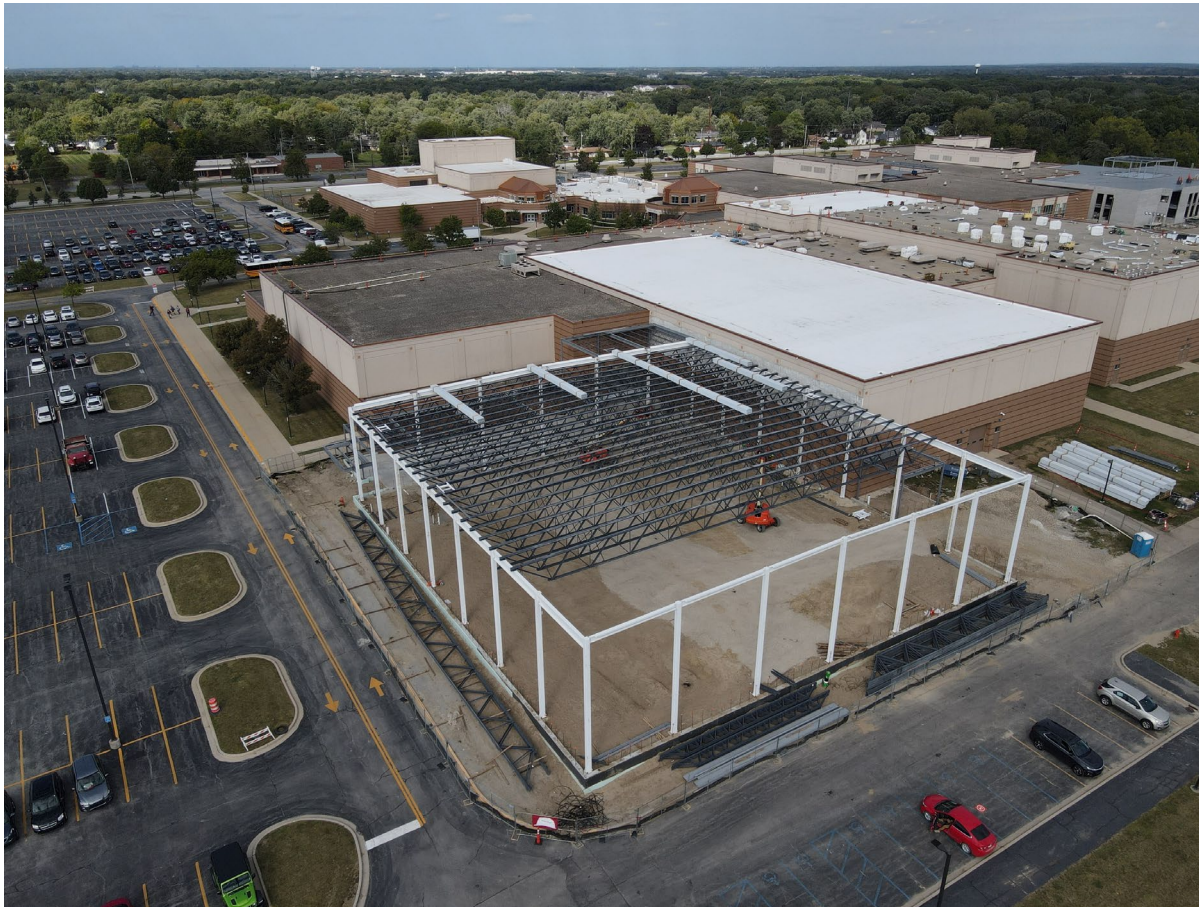
Athletic Addition Structural Steel