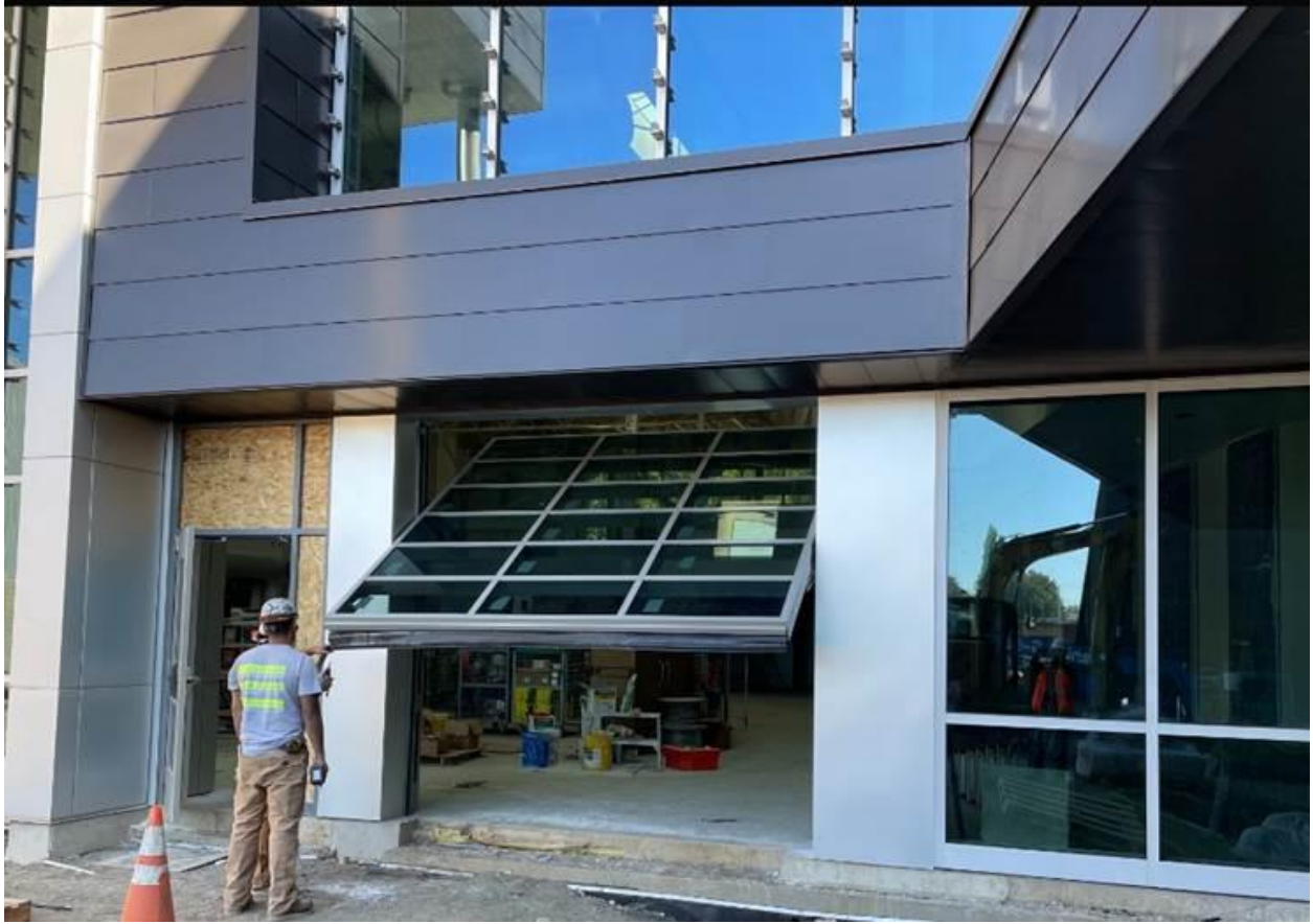
One of two roll-up doors connecting the common area to the courtyard outside