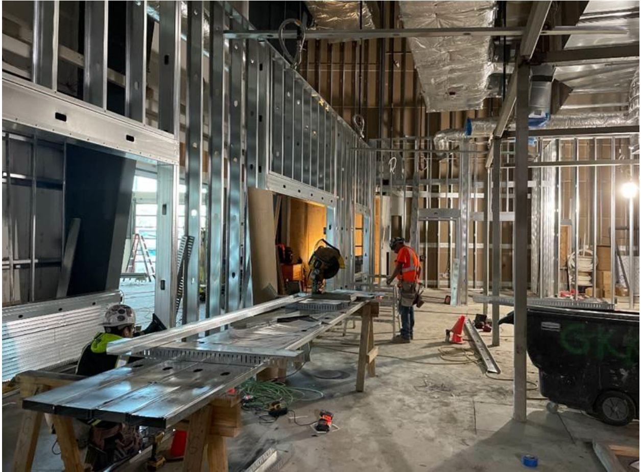
Framing of the serving wall of the kitchen