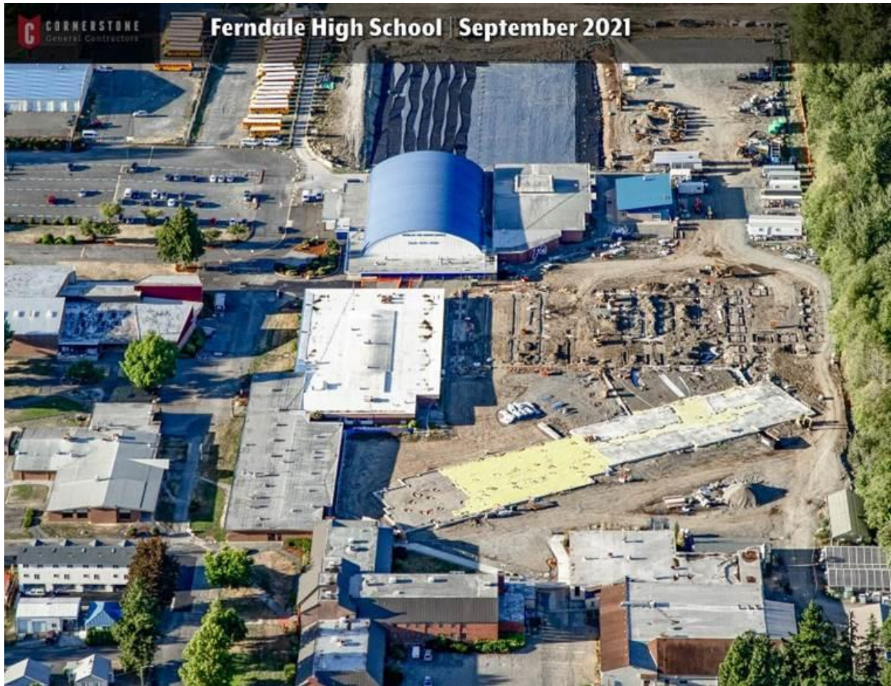
Our school building one year ago ...