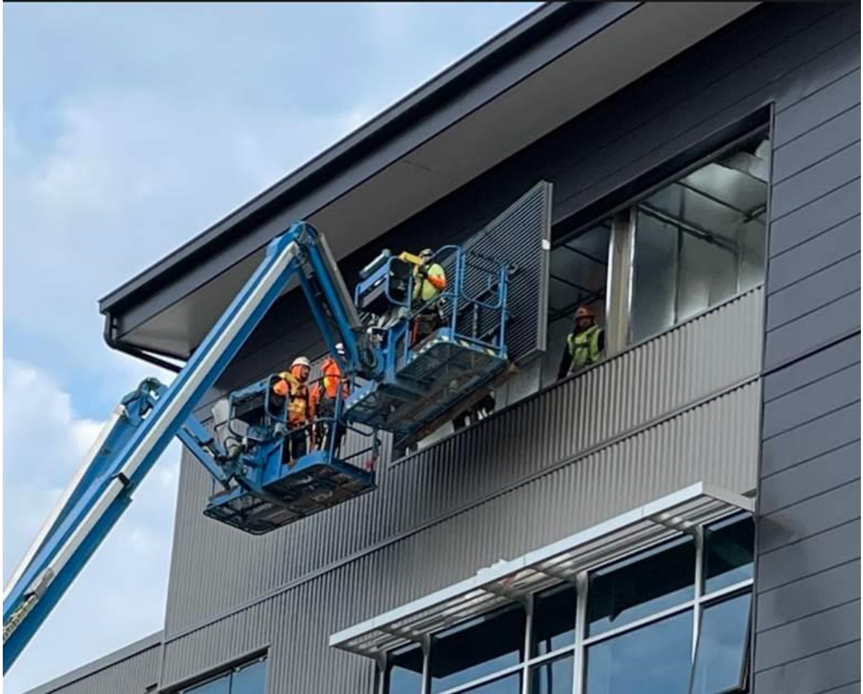
Final louver (slatted window blinds) installation at the rooftop mechanical penthouse