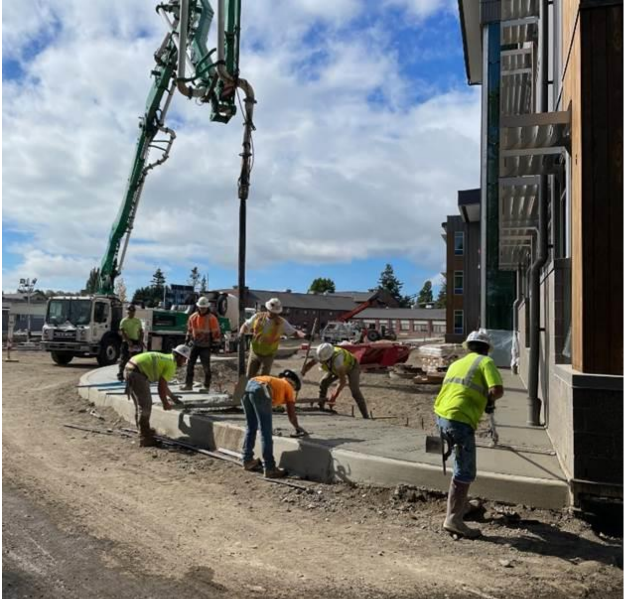
Sidewalks being poured on the south side of the Academic Wing