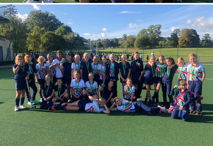
Staff were incredibly proud of our newbies at their first U8s hockey festival at Warminster. Fantastic sparkling performances by all, exciting times ahead for all these superstars!