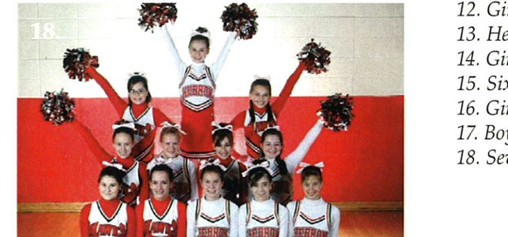
Photos from top left: 1. Hebron Boys C team 2. Hebron High School wrestling team 3. Varsity girls basketball team 4. Boys eighth-grade basketball team 5. Hebron boys varsity basketball team 6. Boys sixth-grade basketball team 7. Hebron girls JV basketball team 8. Boys seventh-grade basketball team 9. Hebron High School cheerleaders and lifters 10. Girls sixth-grade basketball team 11. Hebron boys JV basketball team 12. Girls seventh-grade basketball team 13. Hebron High School dance team 14. Girls eighth-grade basketball team 15. Sixth-grade cheerleaders 16. Girls fifth-grade basketball team 17. Boys fifth-grade basketball team 18. Seventh- and eighth-grade cheerleaders