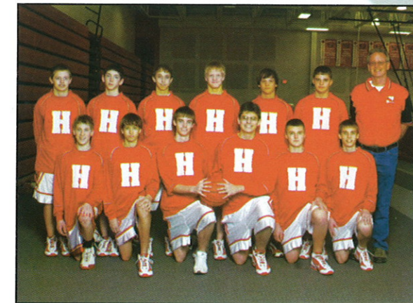
Boys C Basketball