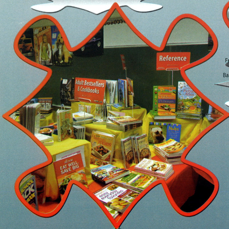
Book Fair 2010