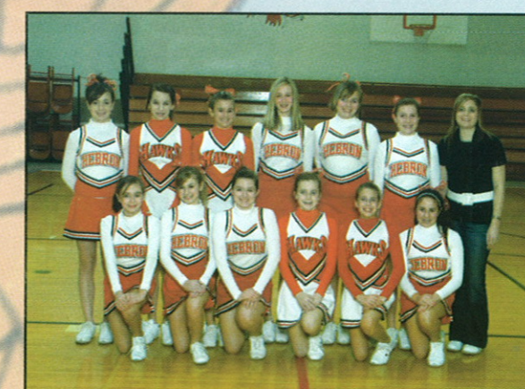
7/8th Grade Cheer Squad