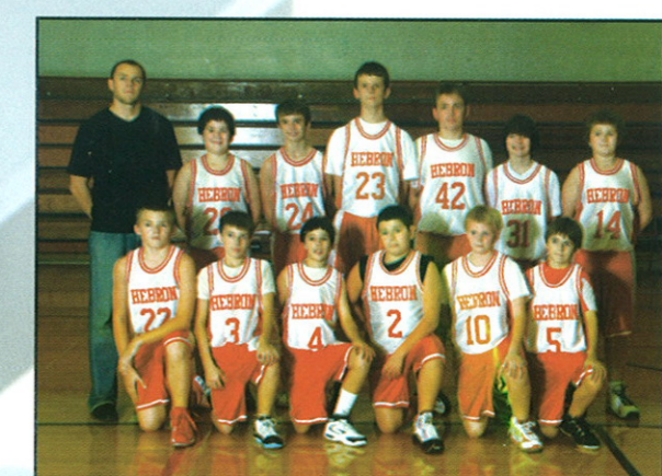
Boys 7th Grade Basketball