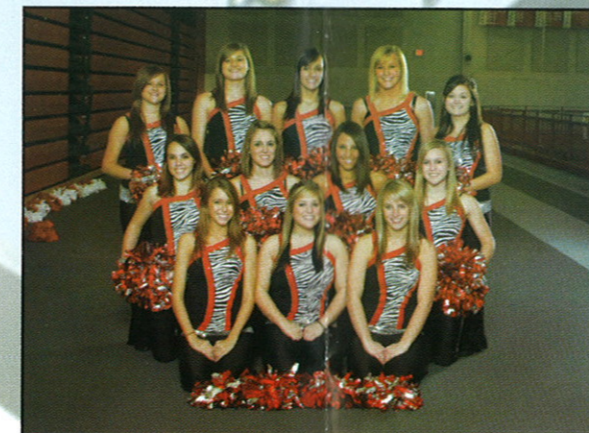
HS Dance Team