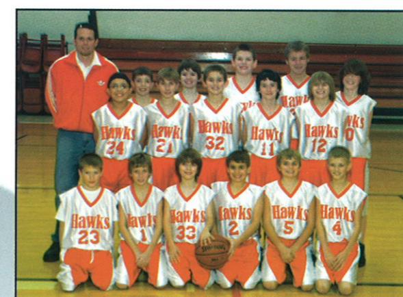
Boys 6th Grade Basketball