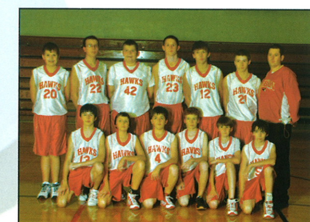
Boys 8th Grade Basketball