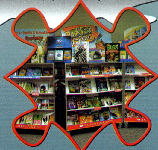
Book Fair 2010