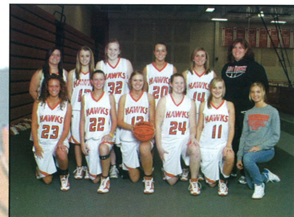
Girls Varsity Basketball