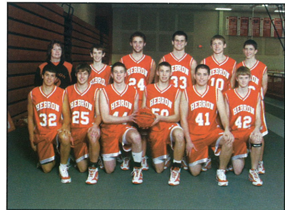
Boys Varsity Basketball