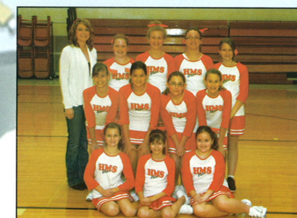
6th Grade Cheer Squad