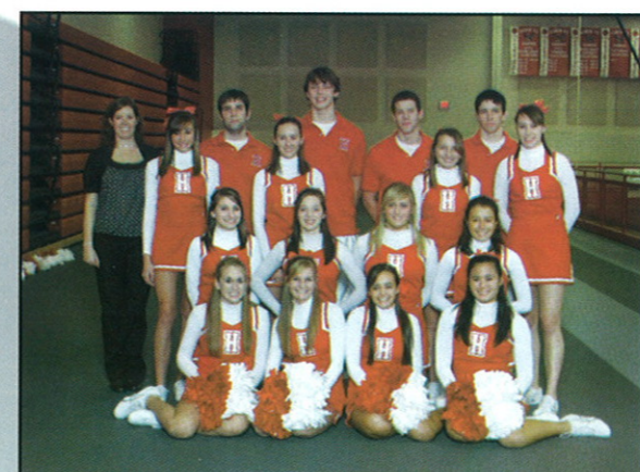
HS Cheer Squad