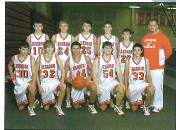
Boys JV Basketball