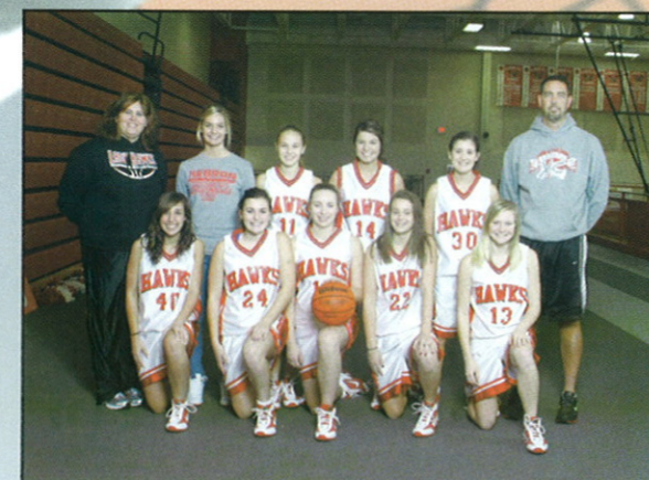
Girls JV Basketball