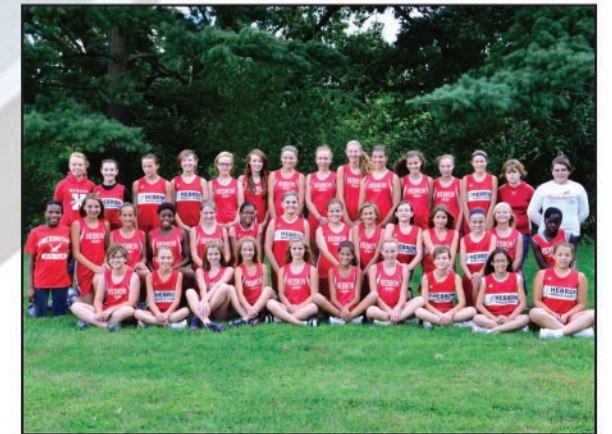
MS Girls Cross Country