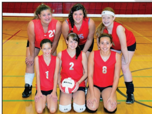
7th Grade Girls Volleyball