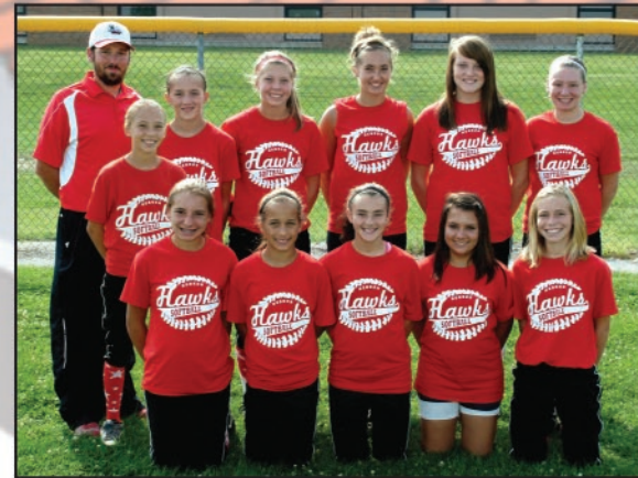
MS Girls Softball