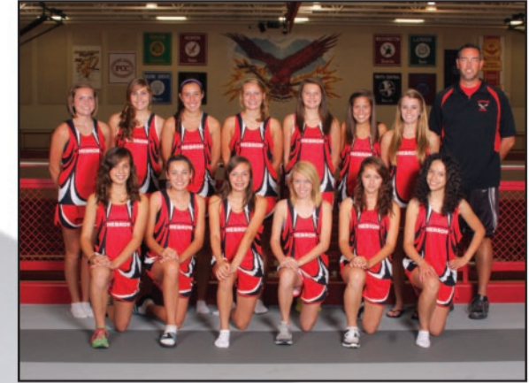
Girls Cross Country