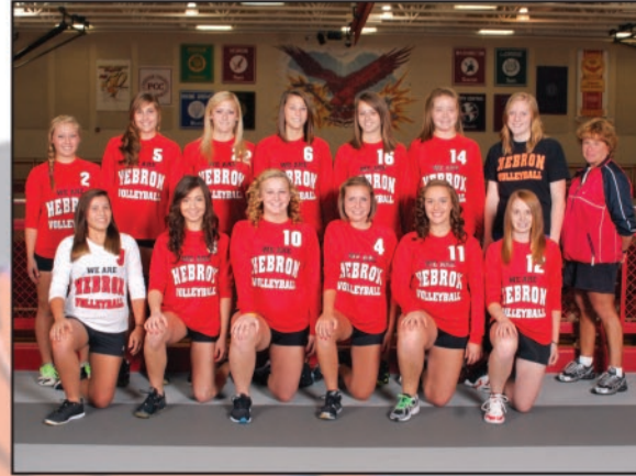
Girls Varsity Volleyball