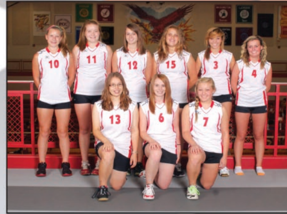
Girls JV Volleyball