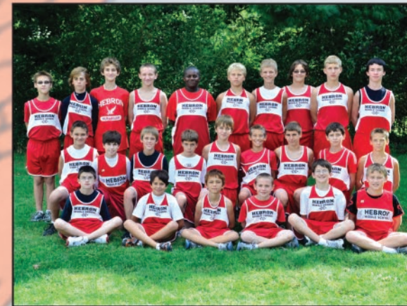
MS Boys Cross Country