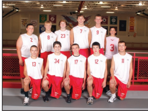
Boys JV Volleyball