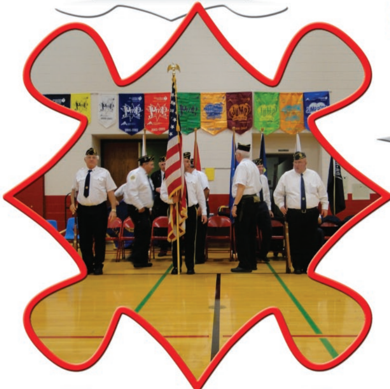
American Legion Hebron Post #190