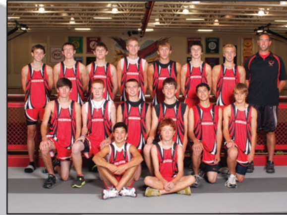
Boys Cross Country