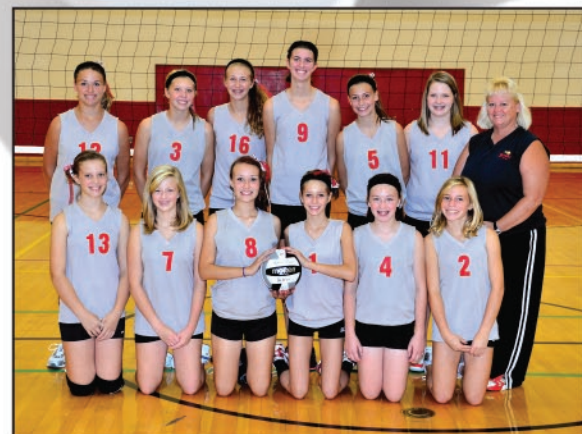
8th Grade Girls Volleyball