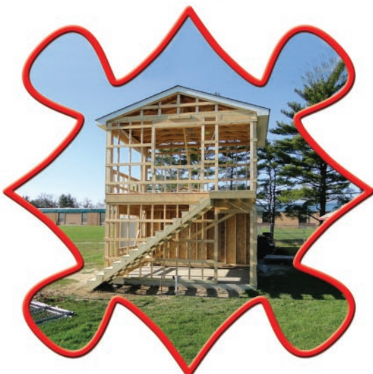
Concession Stand/Press Box for Softball & Track