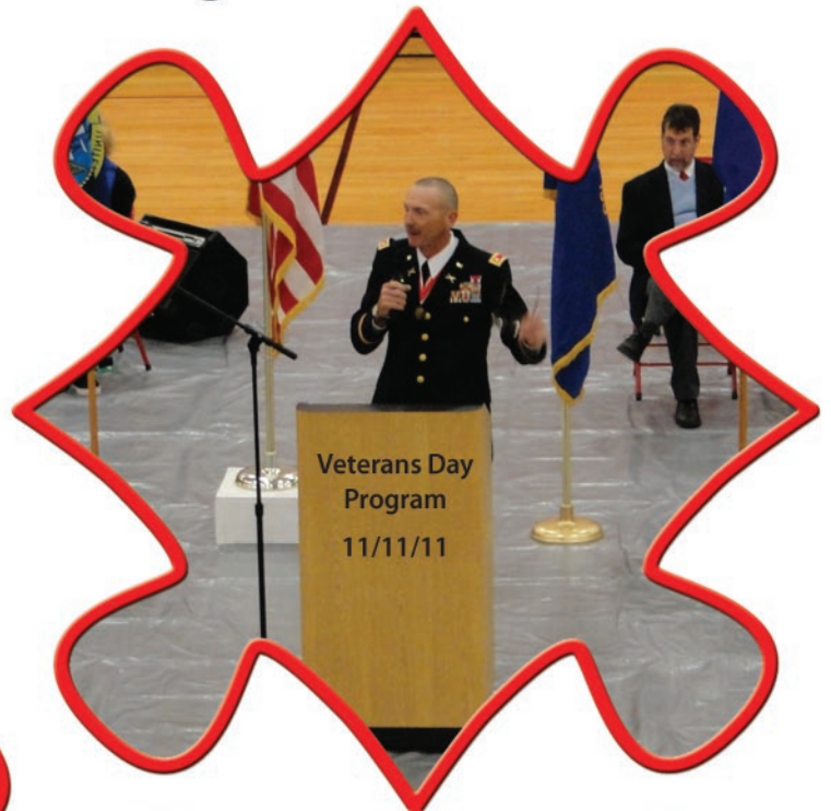
Veterans Day Program 11/11/11