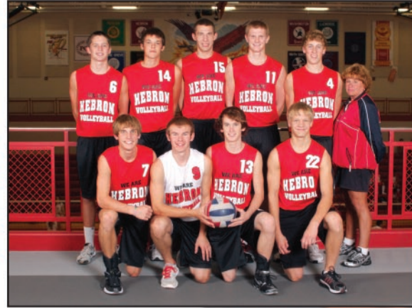
Boys Varsity Volleyball