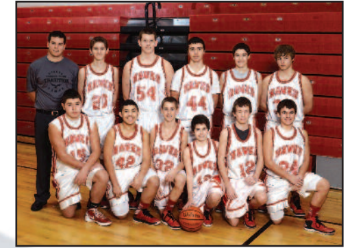
C Team Boys Basketball