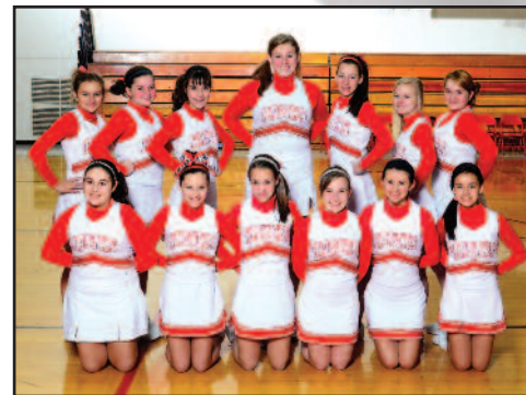
Middle School Cheerleaders