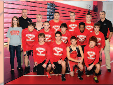
High School Wrestling