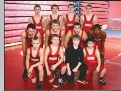
Middle School Wrestling