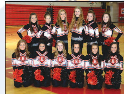
High School Dance Team