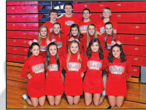
High School Cheerleaders