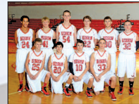
Varsity Boys Basketball