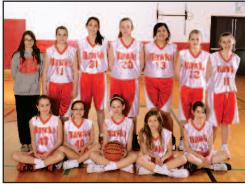
6th Grade Girls Basketball