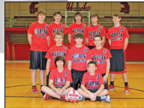
Middle School Boys Volleyball