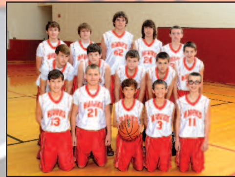
8th Grade Boys Basketball