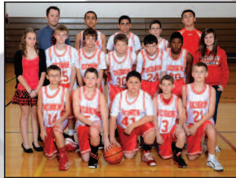
7th Grade Boys Basketball