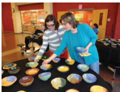
Guests selecting their bowls