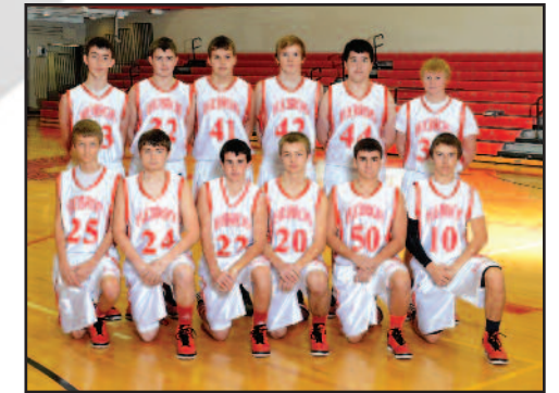
JV Boys Basketball