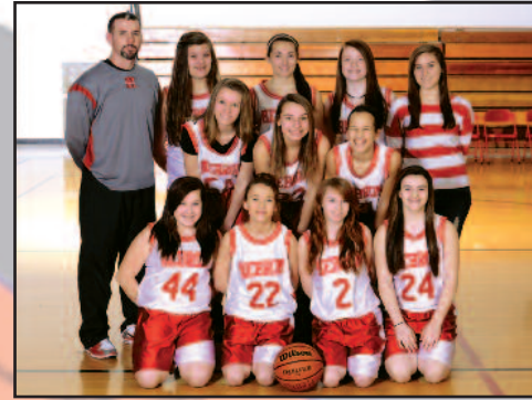
8th Grade Girls Basketball