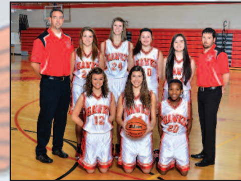
JV Girls Basketball