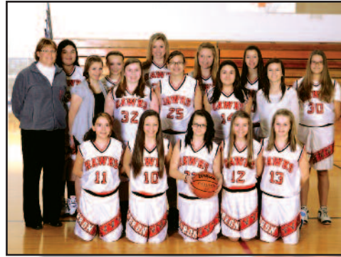
7th Grade Girls Basketball