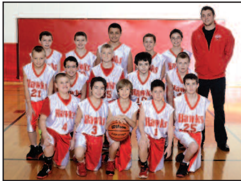
6th Grade Boys Basketball