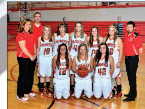
Varsity Girls Basketball